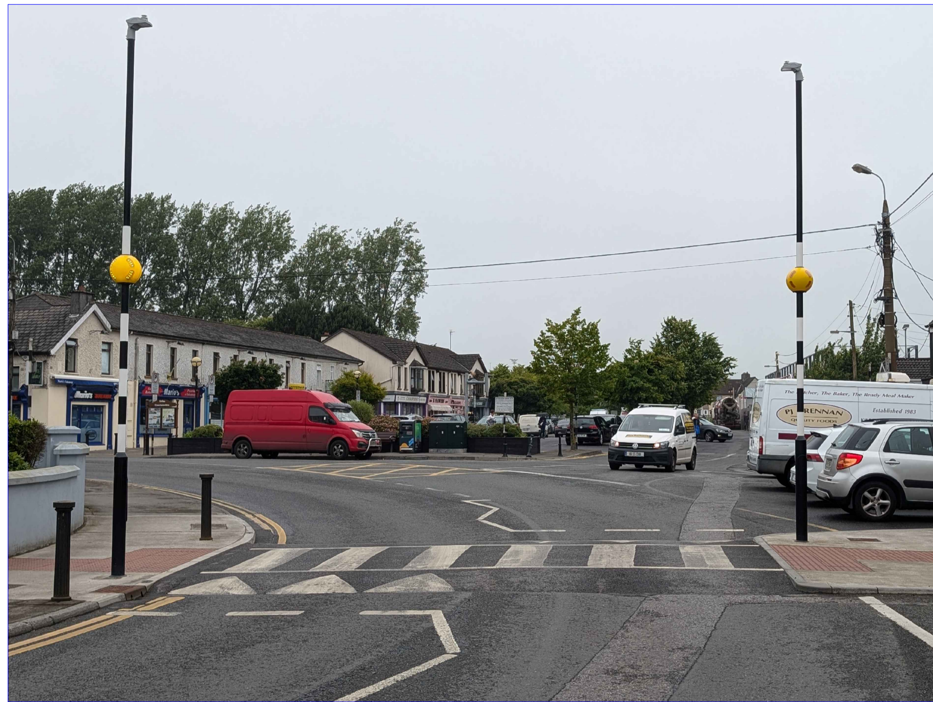
TYPICAL PEDESTRIAN CROSSING LAYOUT