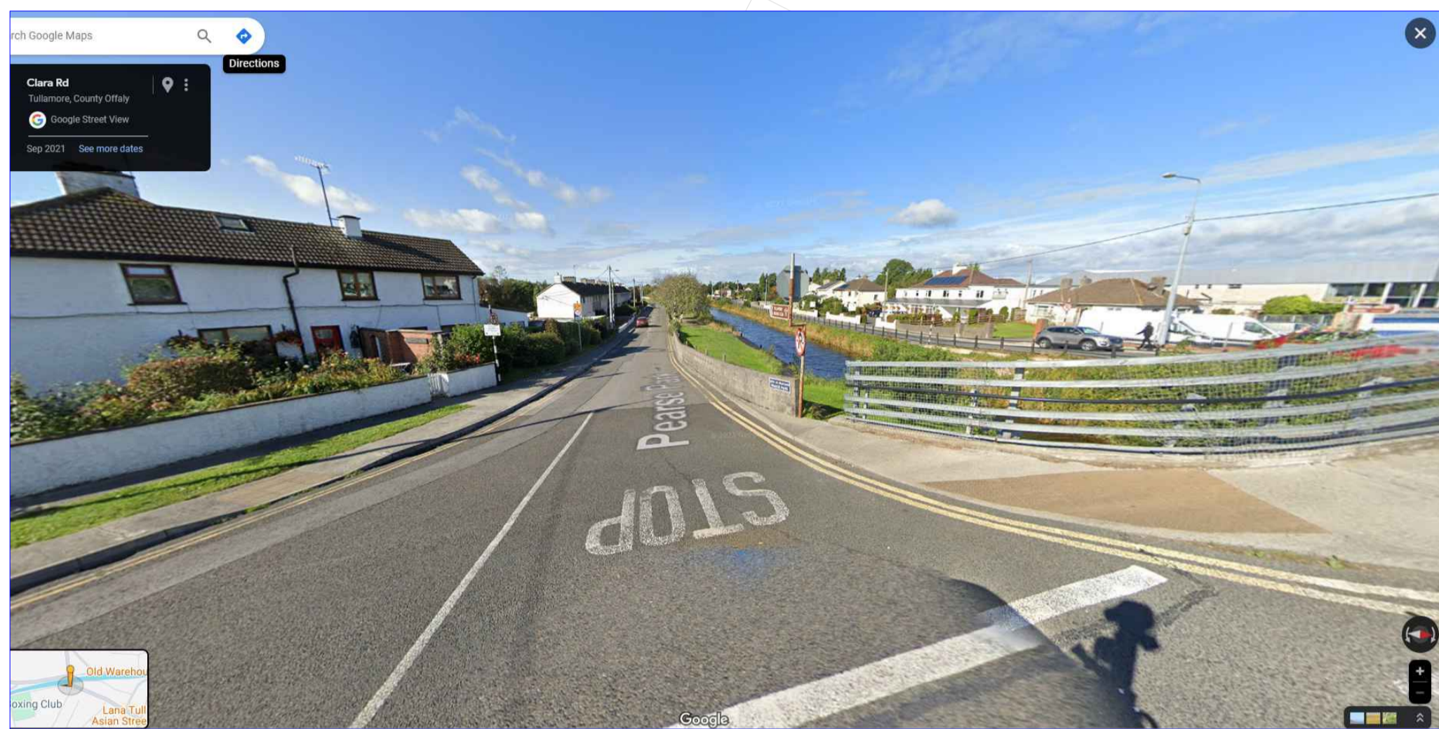
IMAGE SHOWING PROPOSED RE-LOCATION OF EXISTING PEDESTRIAN CROSSING