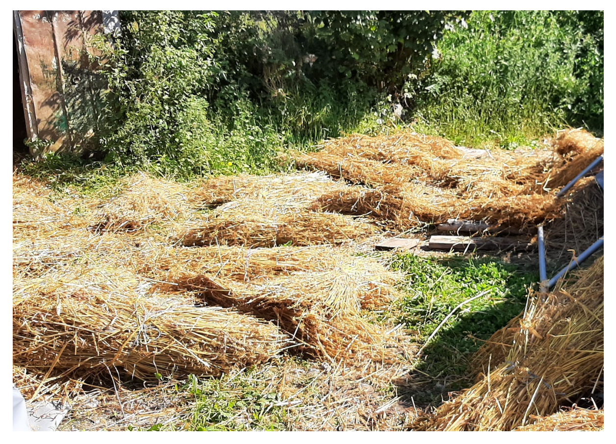
Straw sorted in bundles ready for scaffolding