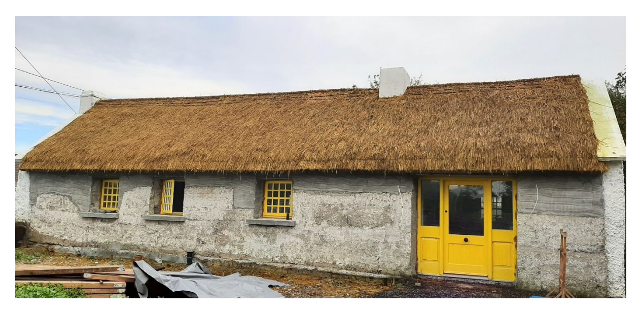
Rear complete and trimmed – October