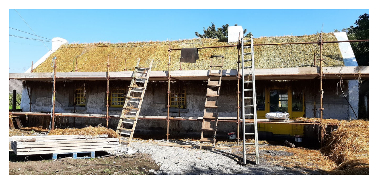
September 2023 – Works underway to the rear of the property