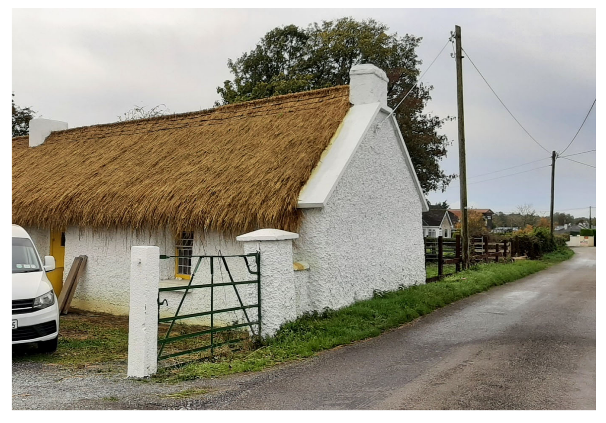
Front elevation thatching finished (eaves trimming outstanding)