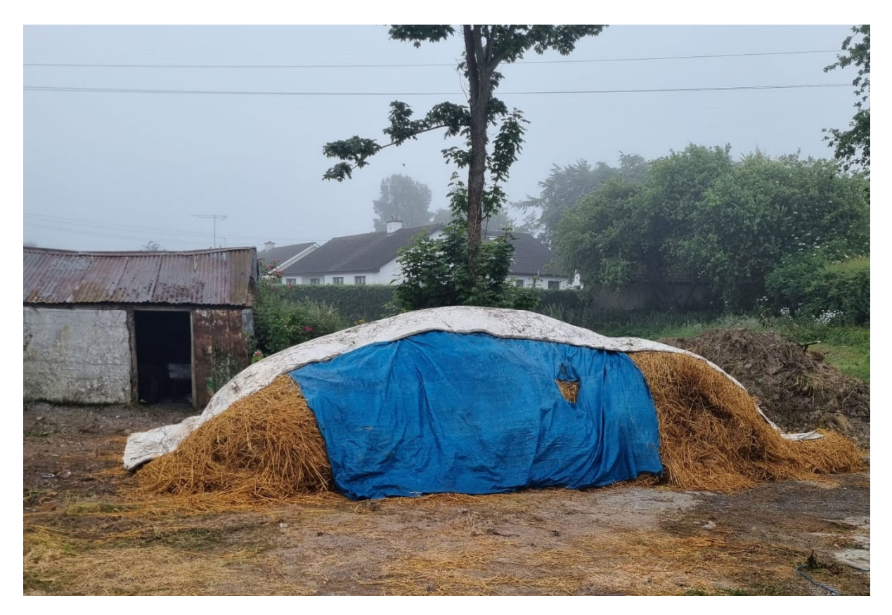
June 2023 – straw on site for preparation