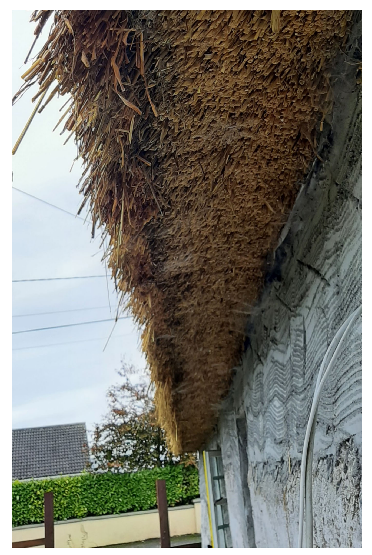
Thatch underside showing former initial layer and current new layer