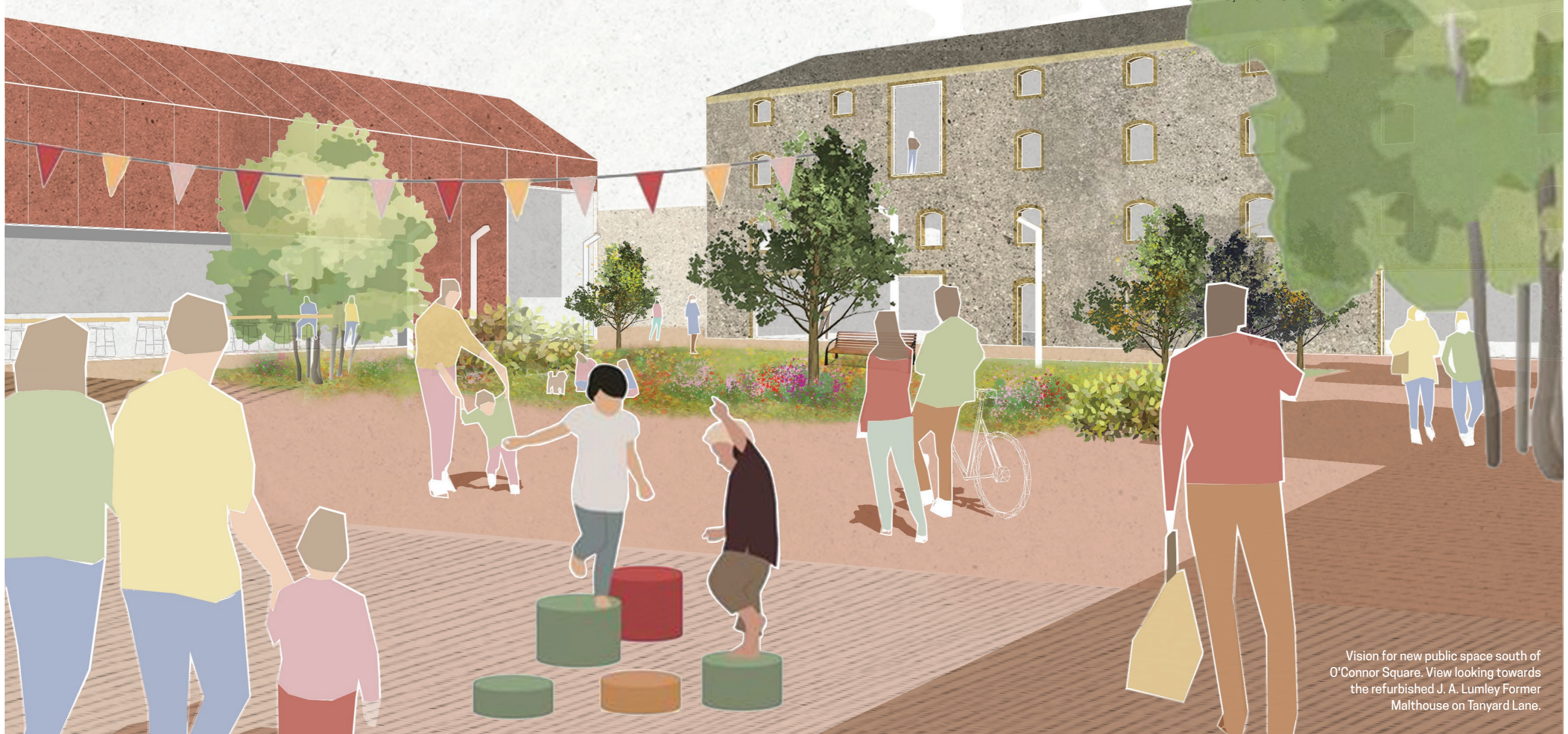
Vision for new public space south of O'Connor Square. View looking towards the refurbished J. A. Lumley Former Malthouse on Tanyard Lane.

By creating animated, sustainable and welcoming places for all, the energy and exchange of the market town can be revived, instilling Tullamore as a key town to live, work and visit.