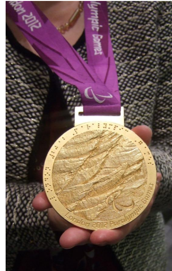
One of the Paralympic Games medals at the Civic Reception held in January 2013

The Staff Newsletter Inside View continued to circulate during 2013.