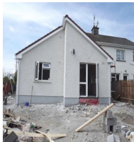
Shinrone DPG works