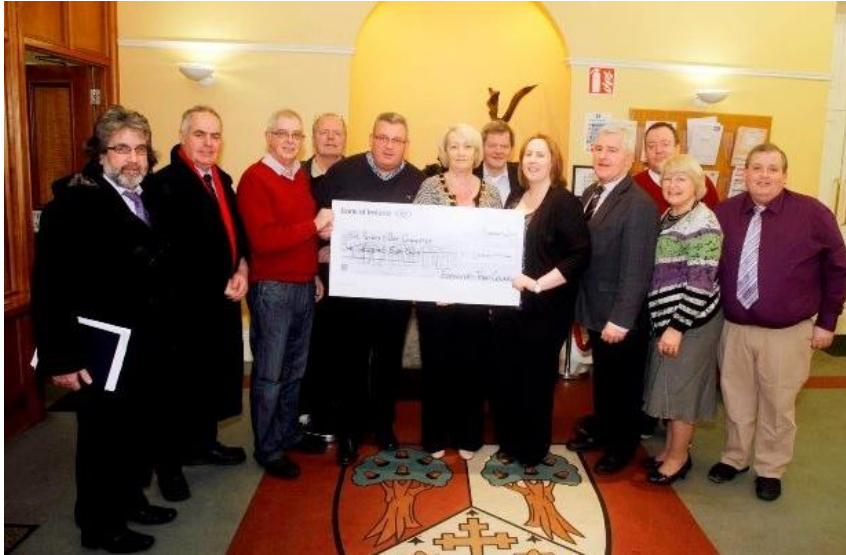
Donation to St Patrick's Day Parade Committee