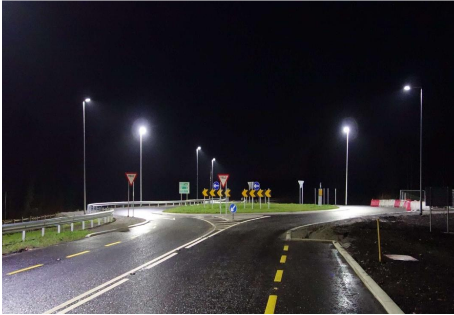
New roundabout on the Tullamore By Pass.