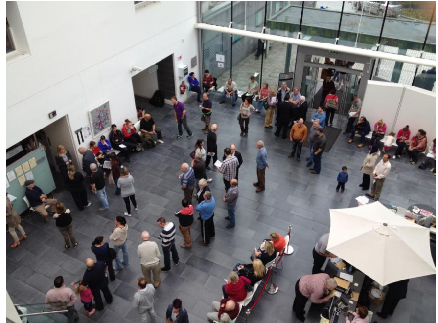
A view of the Motor Tax queue on Monday 30 th September 2013; approximately 750 customers were attended to on the day. Customers seeking to regularise the status of vehicles declared "Off the Road" joined the customers dealing with their motor tax and driver licence applications.

functional area on behalf of the Department of the Environment, Heritage and Local Government. In 2013, responsibility of the issue of driving licences has transferred to the Road Safety Authority (RSA).