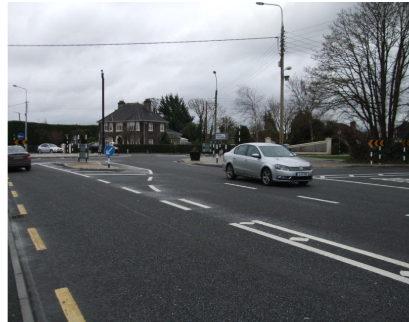
New Road/Church Road Roundabout Tullamore