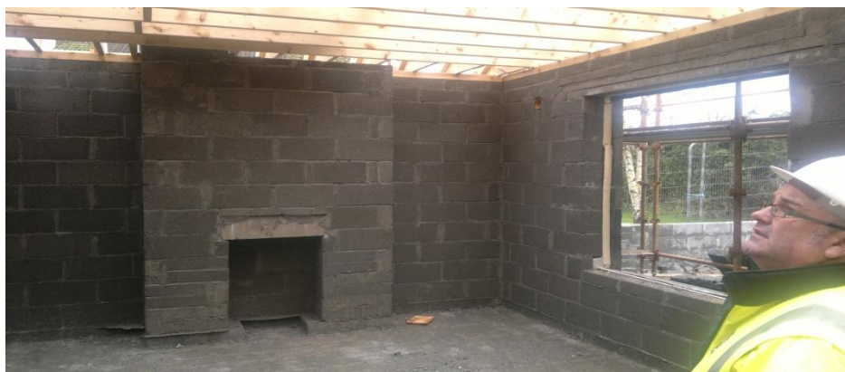
Moylena Tullamore under construction

2013 was €1,868,384 compared to €13m in 2010. The allocation enabled the acquisition of 5 housing units in Tullamore, commencement of Banagher scheme, Energy Efficiency upgrade to 300 houses across the county and completion of 6 DPG's. The Muiriosa Foundation CAS Scheme for the construction of a 6 unit house for the intellectually disabled at Moylena, Tullamore was completed in 2013 and CAS funding for the acquisition of a property in Ballinagar was also secured to accommodate an additional four persons previously housed in institutional care settings