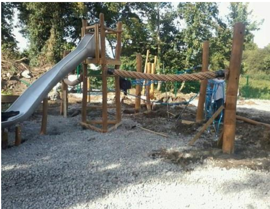
Rhode playground under construction