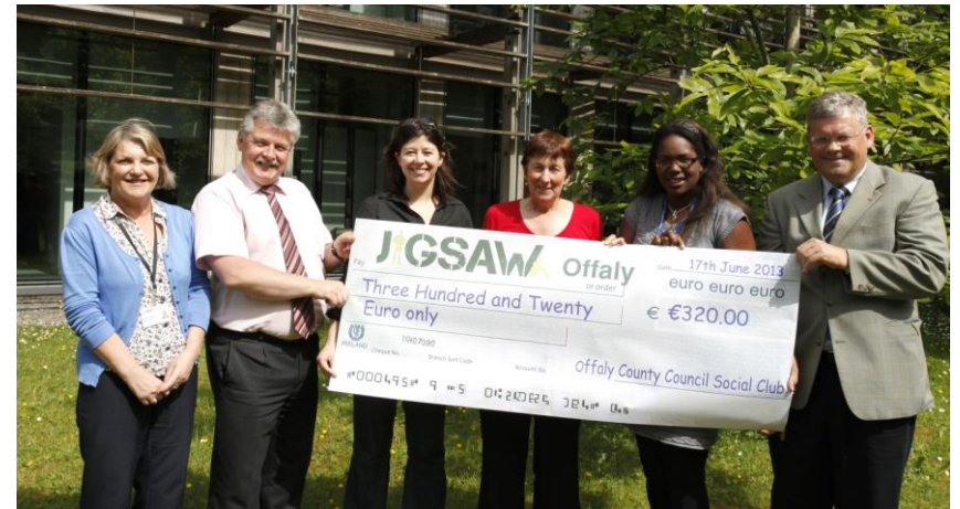
Staff presentation of a cheque to Jigsaw following the Social Club charity walk in May 2013

The Council processed approximately €571k in subsidies to Group Water Schemes in 2013. Over €15K will be paid in Well Grants in 2013. All payments in respect of well grants and subsidy payments are recouped from the Department of the Environment, Heritage, and Local Government on a quarterly basis.