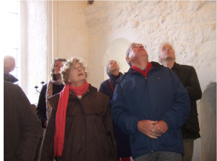
Viewing conservation works in Rahan Church at Annual Offaly Heritage Seminar in November 2013