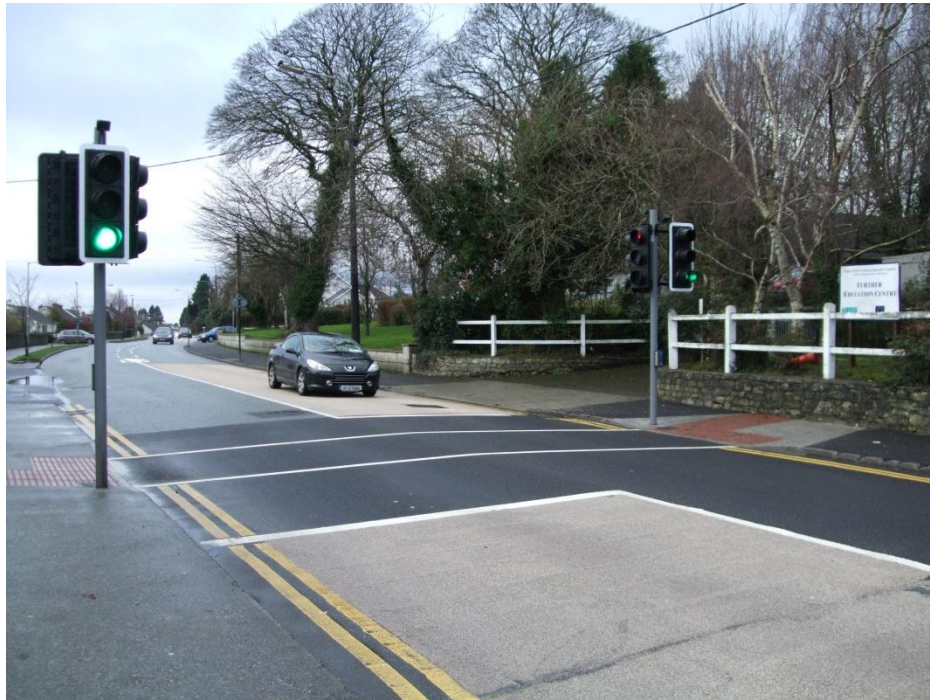
Pedestrian Crossing on the R402 at St Marys Road Edenderry