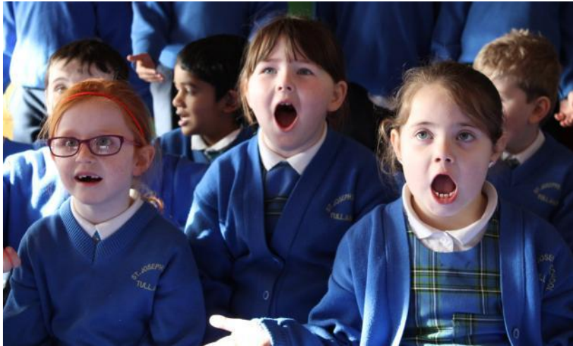
St Josephs NS, Arden Tullamore participating in Music Generation