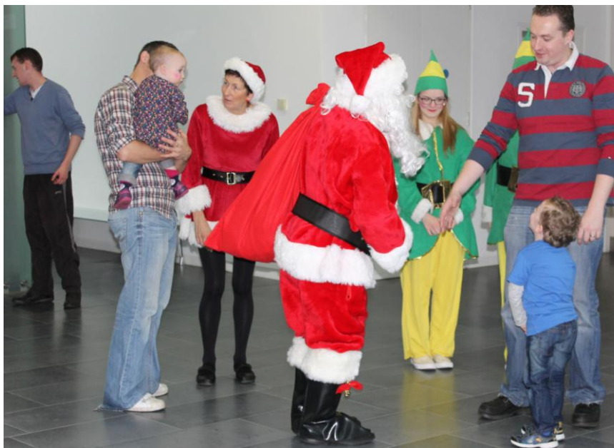
Áras an Chontae plays host to Santa, Mrs Claus and his helpers at the Social Club staff children's Christmas Party in December 2013

Edenderry Swimming Pool Committee's Preliminary Report seeking funding for the development of Edenderry Swimming Pool was submitted to the Department in August 2014.