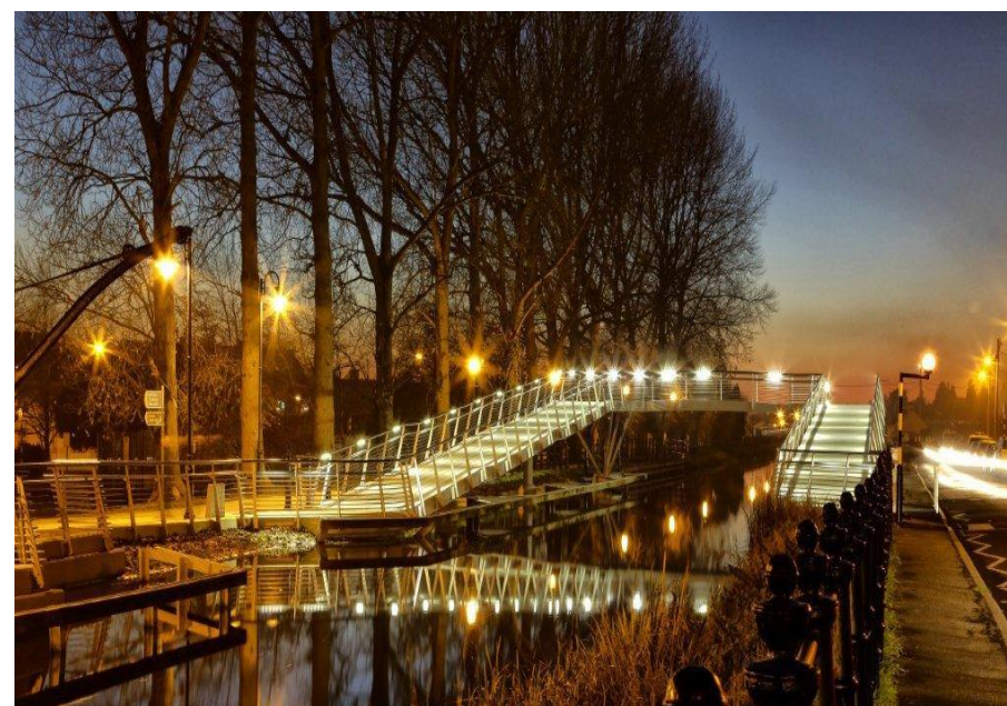
Bridge at Clontarf Road, part of the Grand Canal Project.