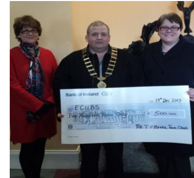
Donation to CCE & Christmas Lights Committee