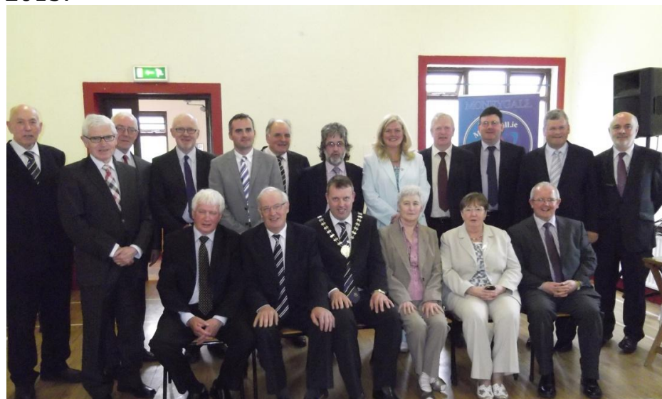
May monthly meeting held in Moneygall Community Centre, 20 th May 2013

The Corporate Policy Group met on 11 occasions during 2013.