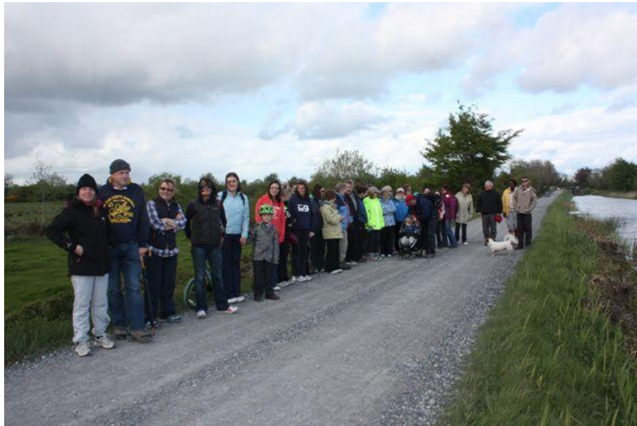
Social Club Charity Walk 2013 in aid of JigSaw