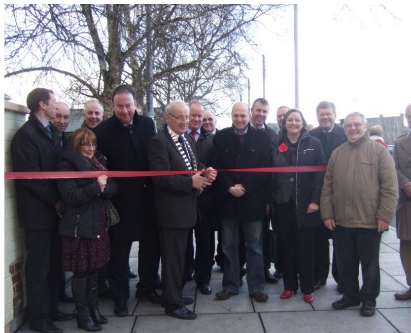
Official Opening of Cornmarket Square