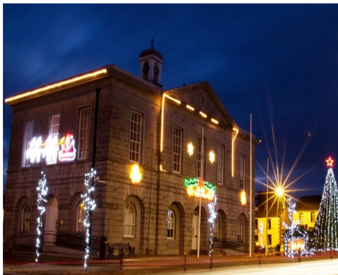
Christmas 2013 at Edenderry Town Hall

Edenderry in 1963. There was an action packed week of events organized by the Fleadh committee which brought large crowds to the town. The members of Edenderry Town Council approved a donation of €1,000 to the committee to help towards running these events. The members would like to thank the staff of Offaly County Council for the time and effort that they also contributed to the events during that week.