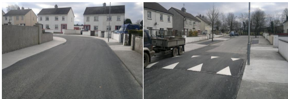
Hill View Cloghan RWS

Municipal Districts will result in the central management of Housing Maintenance functions from 2014. Proposals to rebalance staff compliments in each area are also under consideration. Due to non replacement of staff it has become increasingly necessary to contract out housing maintenance works where local resources are no longer available. A panel of small works contractors was set up in 2008 and houses in need of major refurbishment continue to be contracted out to speed up turnaround time. This panel will be reviewed in 2014.