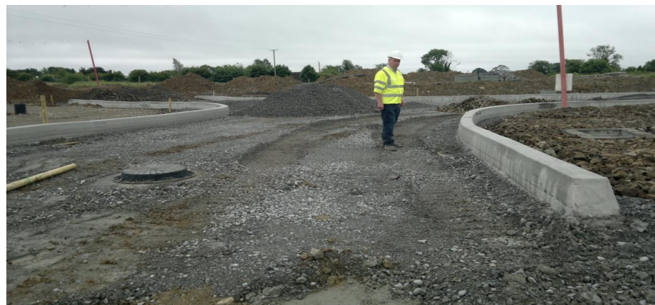
Killane Schools Access road under construction

Housing unit continued to provide corporate technical support services for Library facilities, Aras maintenance and service contracts together with energy efficiency contracting for swimming pools. Specifications for proposed Ferbane Fire Station were drafted and Tenders were awarded for the construction of an access road through Council lands at Killane Edenderry to facilitate future school provision. Funding for the construction of the road was provided by the Department of Education & Skills and works supervised by the Housing Unit.