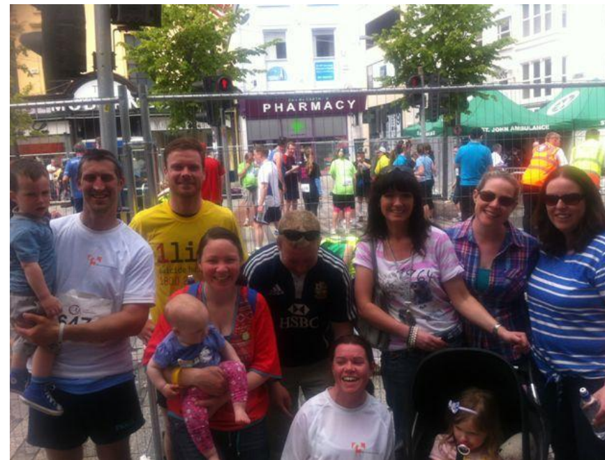
IT staff in two teams completed the Cork Marathon in aid of the 3T's – Turn the Tide Charity in June 2013. The relay teams finished in 4hrs-42 mins and 4hrs-50 mins.