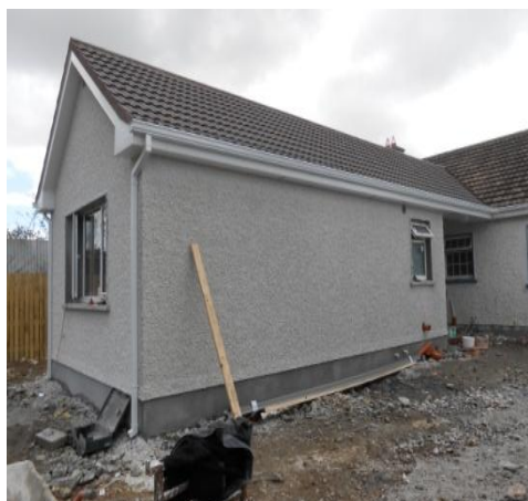
DPG works underway at Belmont