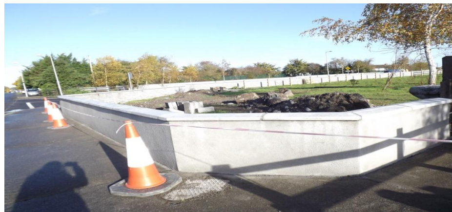
Estate Works at Meadowlands, Kilcormac

There was one sale completed in 2013 but 2 offers previously received were withdrawn. A considerable debit balance remains on lands acquired and developed previously for this purpose. Revised criteria for the sale of private sites was adopted by Council in 2010 and sites made available for sale on the open market without restriction. 46 sites remain available in 5 locations. Considerable remediation works were completed at the Meadowlands Kilcormac scheme to complete estate entrance road and to block access to part of the estate subject to frequent illegal encampments.