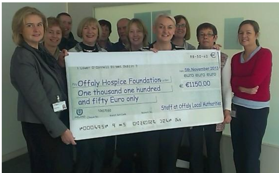
Staff present a cheque to Offaly Hospice Foundation following a "Coffee Morning" fund raising event.

€1,725,785 was spent on 2013/2014 Student Grants during this period. This money is recoupable from the Department of Education & Skills, except for a fixed contribution made by Offaly County Council. The administration of the scheme is a service provided by this Council to students and parents in County Offaly.