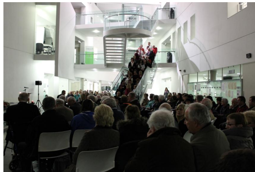
The large attendance at the Ecumenical Service held in Áras an Chontae on 13 th November 2013