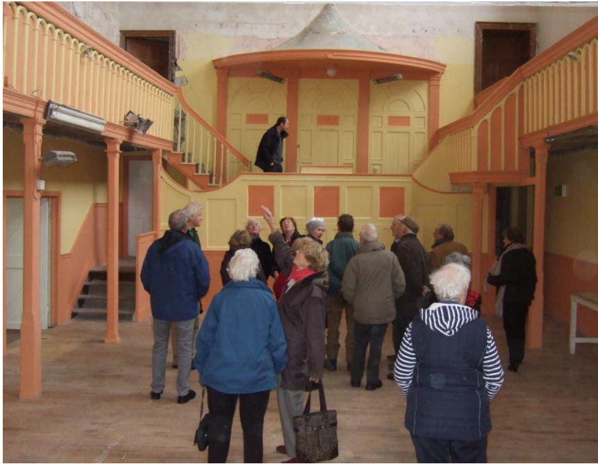
Viewing conservation works in Daingean Courthouse at Annual Offaly Heritage Seminar in November 2013