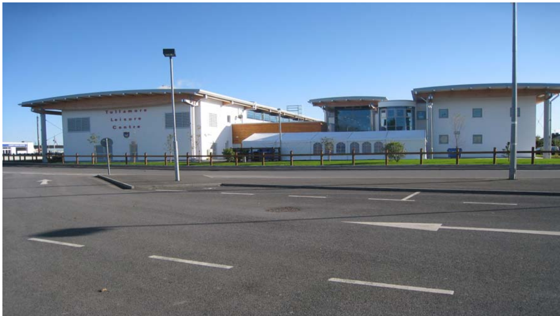
Tullamore Leisure Centre opened October 2008