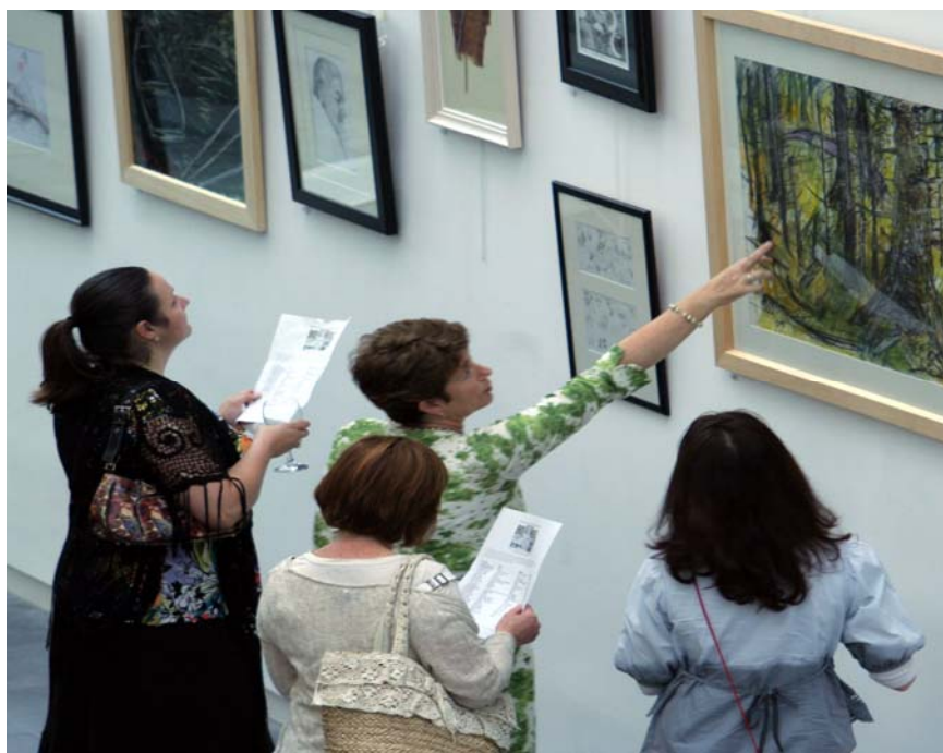
Opening of the Open Submission Exhibition featuring works from Offaly Artists

Total value per 1000 population €5,167.43