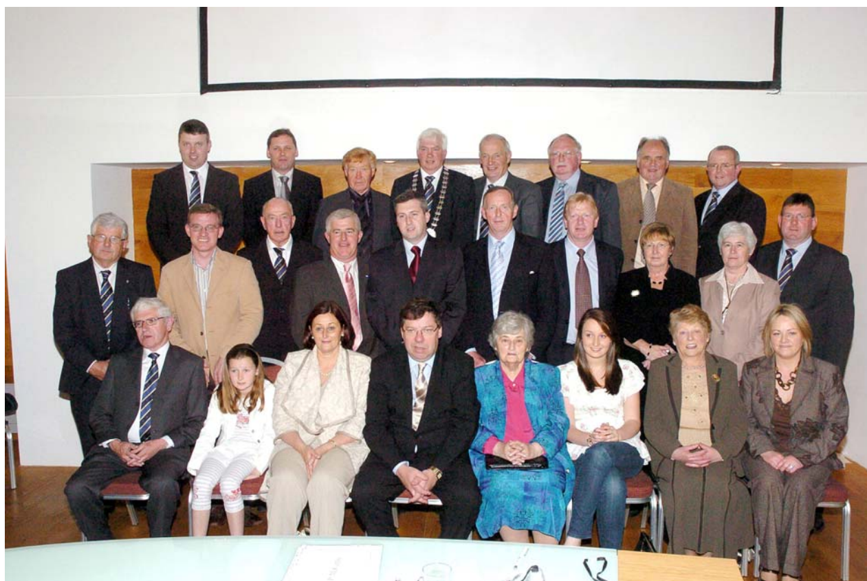
Taoiseach , Mr. Brian Cowen, T.D., Council Chamber, Áras an Chontae, 10 th May 2008

A Civic Reception to honour the Taoiseach, Mr. Brian Cowen, T.D. was held on 10 May 2008 at Áras an Chontae.