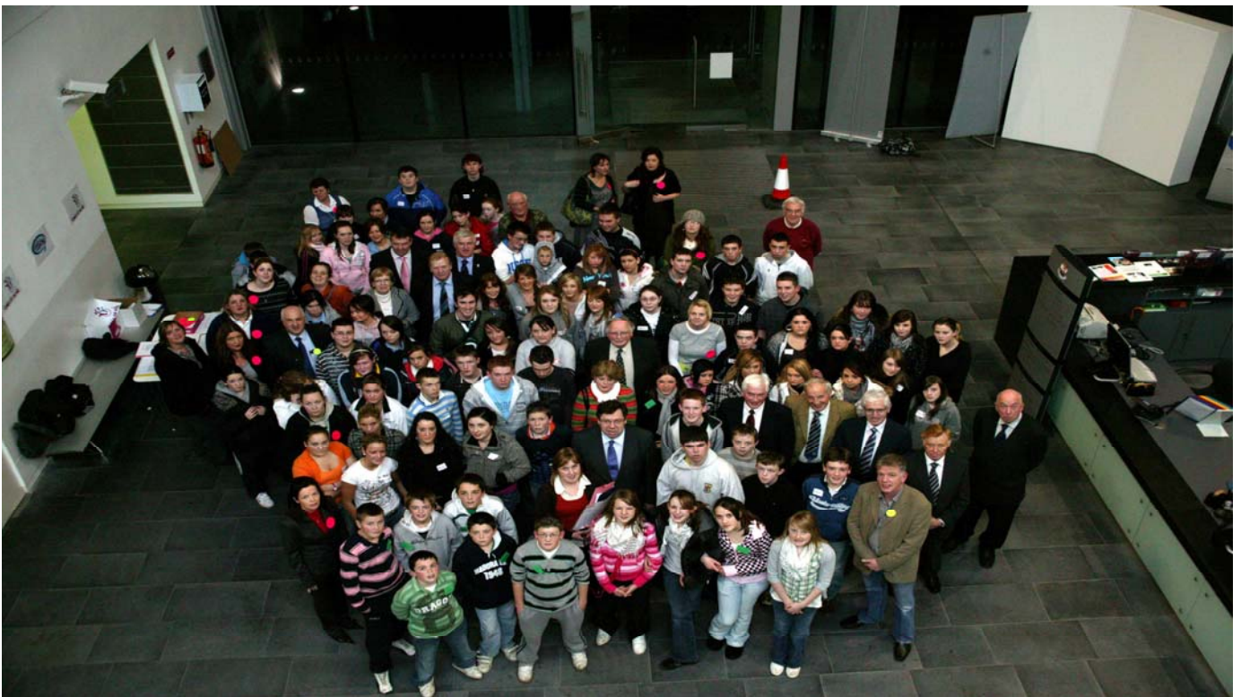
Offaly Comhairle na nÓg Election, November 2008

During 2009 the C & E Department will continue to support other initiatives such as Offaly County Council Chairman's Awards, developing a volunteer centre for Offaly Pride of Place, Promoting best practice and community enhancement, continued participation in the Offaly Outreach Education Programme and participation in the Inter-Agency Group of the County Development Board in relation to disability.