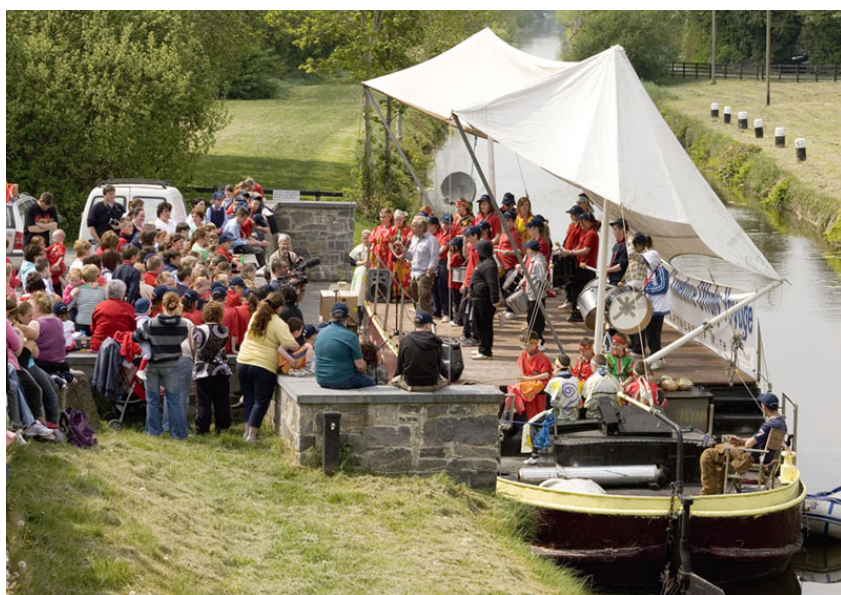
Floating Theatre in Daingean