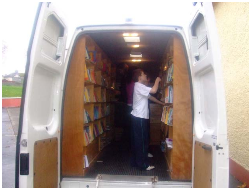
Children selecting books during a visit by Offaly County Library's Schools Service to their school.

The Department of Education and Science contributed over €43,000 for the purchase of stock for primary schools. The County Library Service's Schools Department provides library services to over 9,500 children in the 68 primary schools. Each school was visited by library staff to promote and provide services. Books are carefully selected by staff of the Schools Department to meet the needs of the individual school. Many teachers also visit the Schools Library Department where they are facilitated in making their own selection and are advised on the range of resources available.