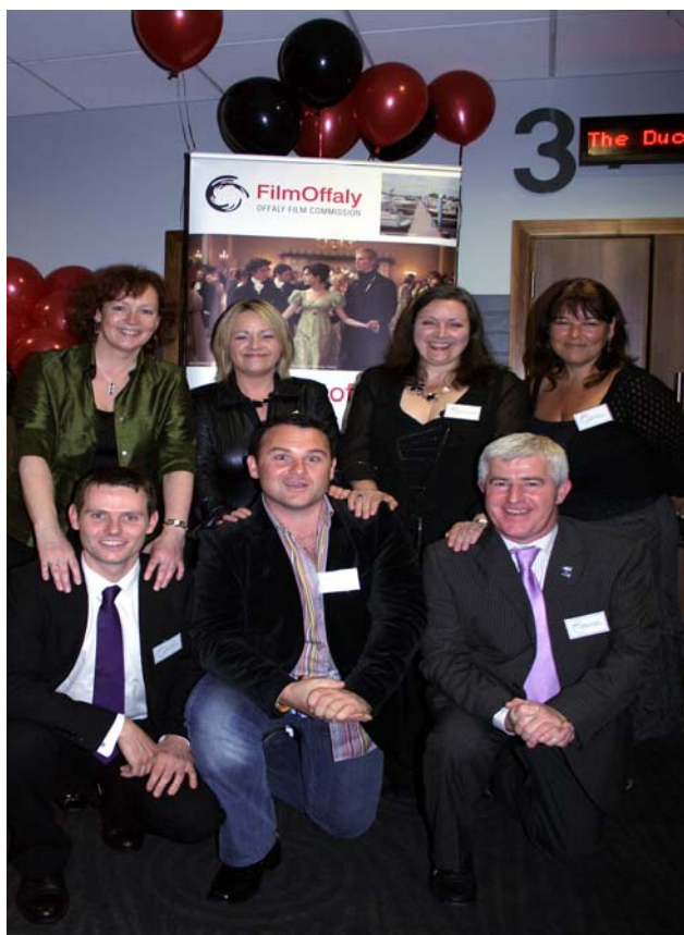
Launch of FilmOffaly