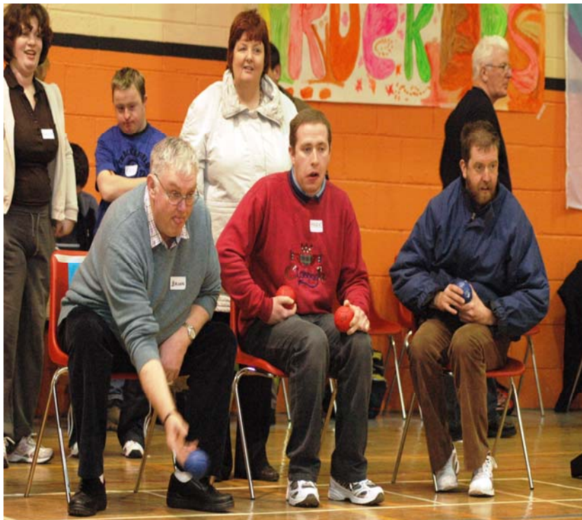
Offaly Sports Partnership

Disclosure of Donation Statements and Declarations of Interest Returns were made by all members of Edenderry Town Council.