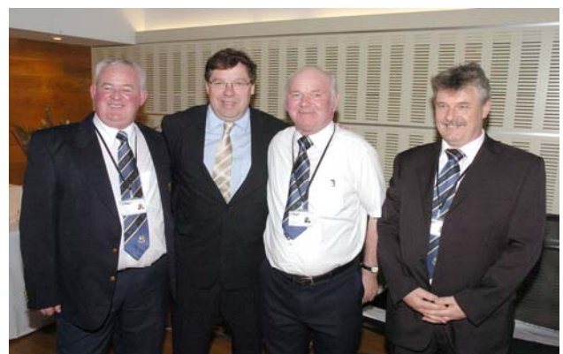
Taoiseach, Mr. Brian Cowen, T.D., Council Chamber, Áras an Chontae, 10 th May 2008