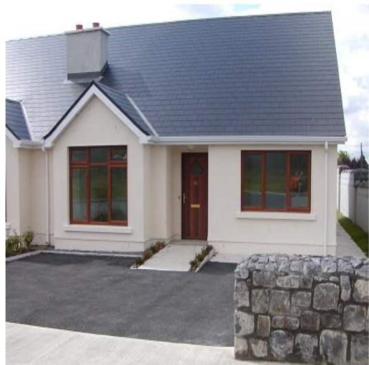
Affordable Houses: Glen Cumin, Shinrone and Heather Grove, Clara