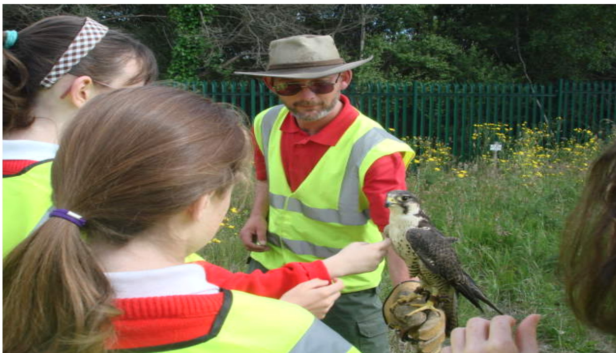
Comhairle na nÓg: Knowing your Local Authority, Schools Initiative, Derryclure Landfill

Offaly County Council's Veterinary Department is responsible for carrying out functions in relation to Food Protection and Disease Control. It implements the terms and conditions of a Service Contract between the Food Safety Authority of Ireland (FSAI) and Offaly County Council in relation to the slaughter of food animals, and imposes statutory controls on the production of meat, meat products and poultry. Its principal functions in relation to food safety relate to small Slaughtering Premises, Slaughter House Approvals and Slaughter Man Licensing; approval and supervision of small meat manufacturing premises; and supervision and inspection of dairy production holdings.