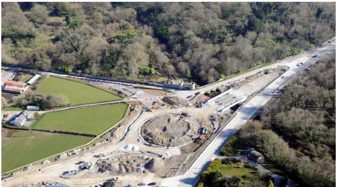
Aerial view of Mucklagh Roundabout & S02: Clodiagh Underbridge