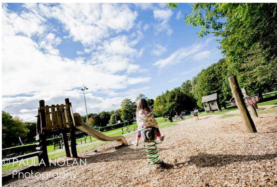
Figure 9.2 Lloyd Town Park and Playground Tullamore