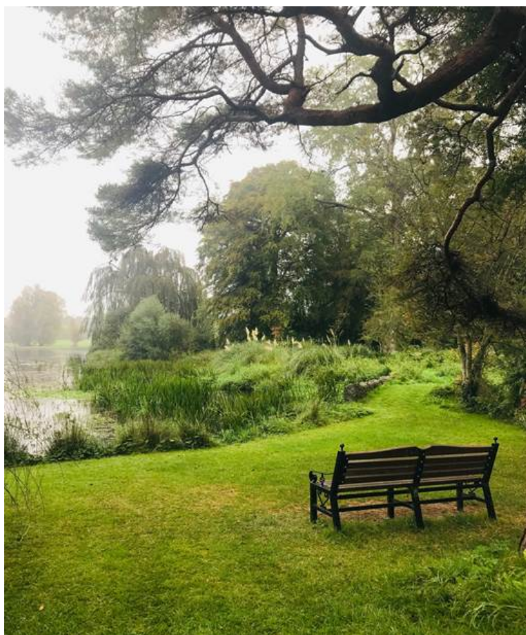
Figure 9.4 Birr Castle Gardens