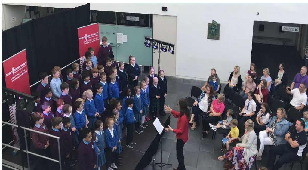
Figure 9.9 Singing Performance during Culture Night held at Áras an Chontae