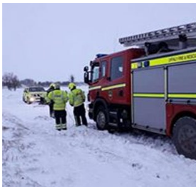
Figure 9.10 Offaly Fire Services

The role of Offaly County Fire and Rescue Service is to prevent the occurrence of fire and to protect life and property throughout the county. There are presently five stations in the county in Birr, Clara, Edenderry, Ferbane and Tullamore. The Council will continue to support the provision of a modern and effective fire service for the county.