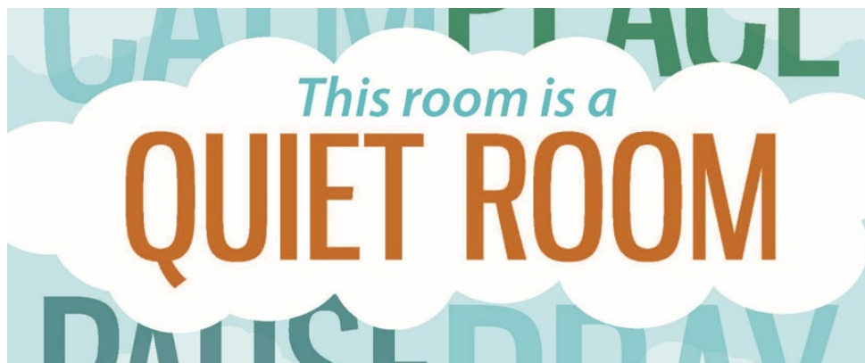
Figure 9.3 Quiet Room

The Irish Wheelchair Association and Sport Ireland’s ‘Great Outdoors - A Guide for Accessibility’ (2018) provides guidance on accessible design to make specific outdoor environments more available and accessible for people with a disability including trails/greenways, public parks / playgrounds and the built environment in the great outdoors.