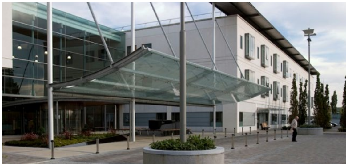
Figure 9.6 Midland Regional Hospital Tullamore

locations throughout the county. The Council considers that medical practices should be provided for within town, village, or neighbourhood centres, preferably in purpose built premises and in locations which should have minimal impact on residential amenity.