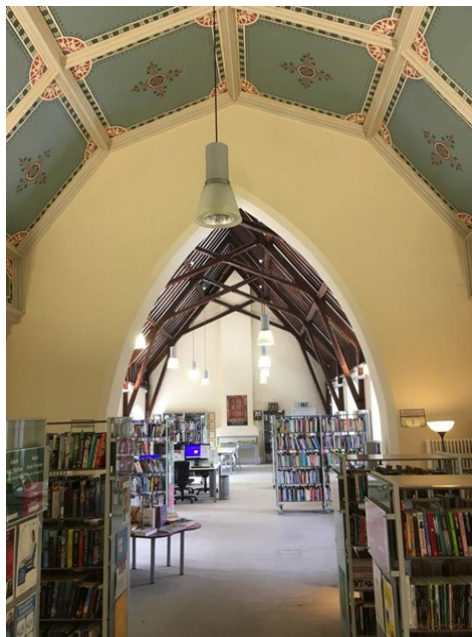
Figure 9.7 Birr Library, Exterior and Interior