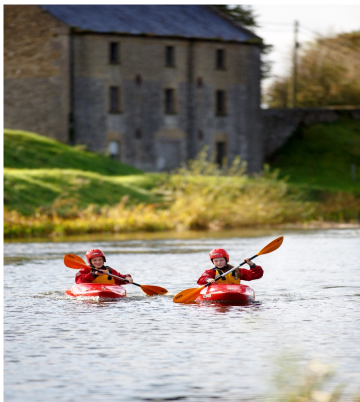
Figure 9.1 Water Sports on the Grand Canal in Daingean

The Department of Rural and Community Development's CLÁR programme provides funding for small-scale infrastructural projects in rural areas that have suffered significant levels of population decline. CLÁR aims to support sustainable development in identified areas by attracting people to live and work there. The funding works in conjunction with local funding and on the basis of locally identified priorities. Offaly Council will continue to consult and work with local communities in accessing available funding for CLÁR projects.