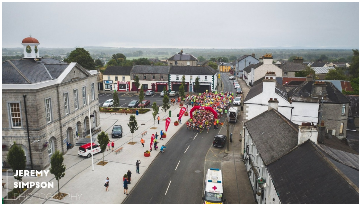
Figure 9.5 Start line of running event in O'Connell Square, Edenderry where significant public realm works were carried out in 2017 under the Town and Village Renewal Scheme.

of sustained local increases in participation levels in sport, physical activity and active living in Offaly in line with the national participation objectives of the Irish Sports Council. The Planning Authority has a role in protecting existing sport / recreation and open space areas and ensuring that adequate land is zoned for development to accommodate sporting and recreational facilities, both active and passive.