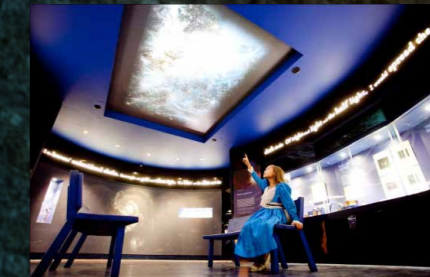
Upgrade to the Visitor Centre Science Galleries at Birr Castle