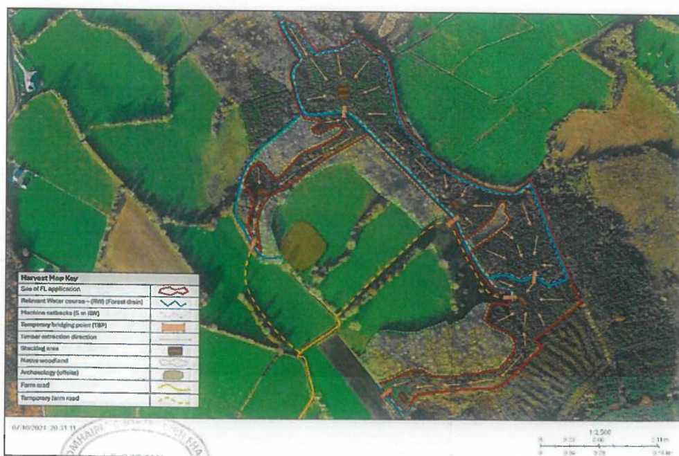
Figure 1: Plan submitted at FI stage.

The Applicant has provided a 'Harvesting Plan Map' which indicates that it is at a scale of 1:2500 in the bottom right corner.