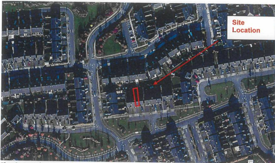
Figs 3: Aerial image of location of site