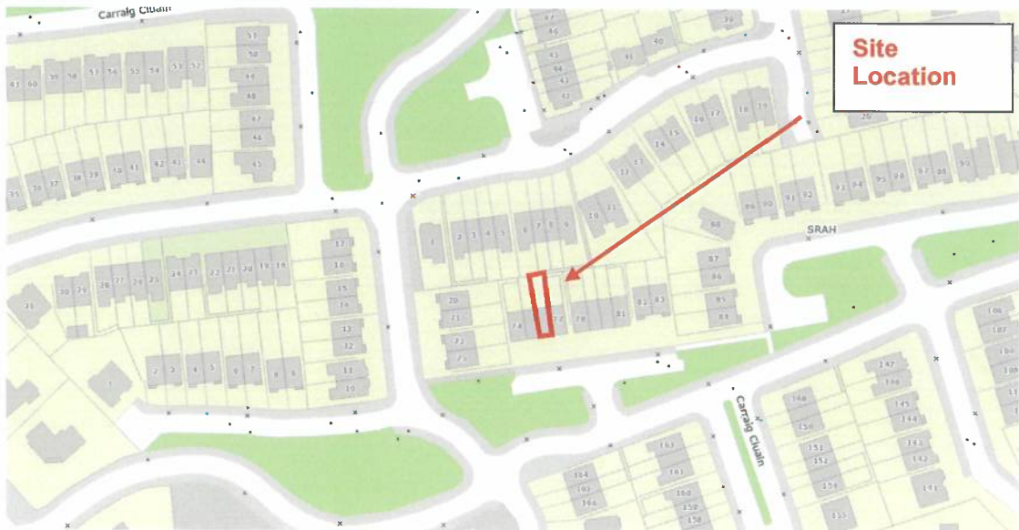
Figs 2: Site Location