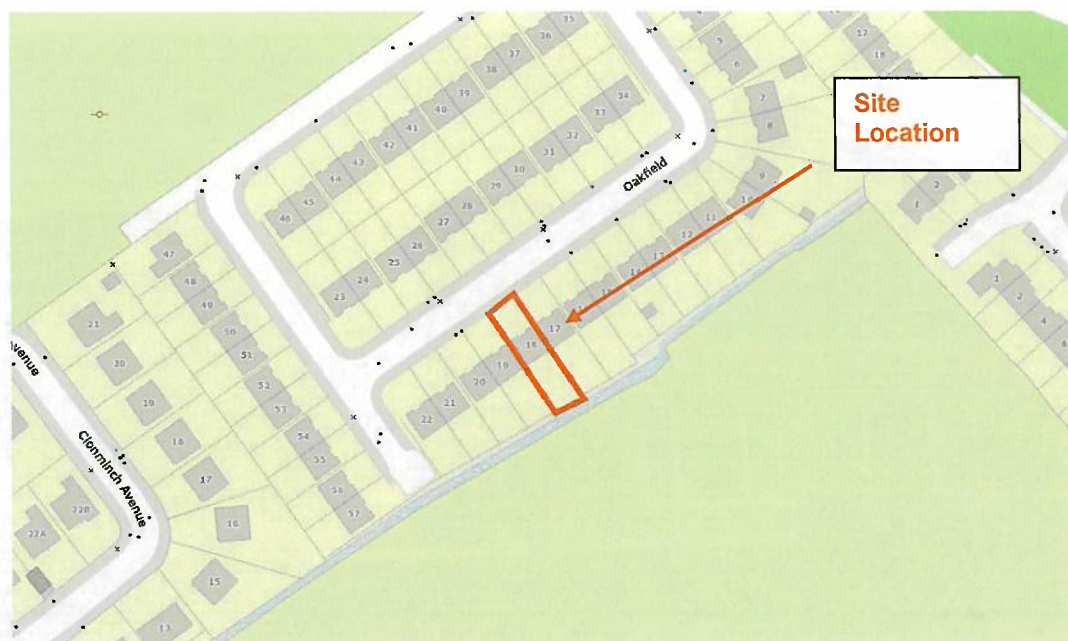
Figs 2: Site Location