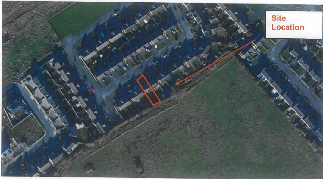
Figs 3: Aerial image of location of site