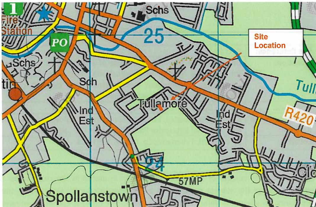
Figs 1: Site Location (Discovery Series)