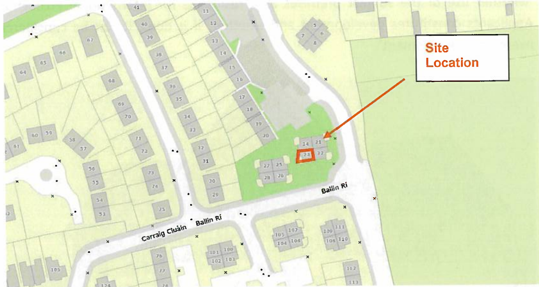
Figs 2: Site Location