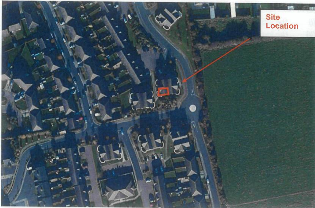
Figs 3: Aerial image of location of site