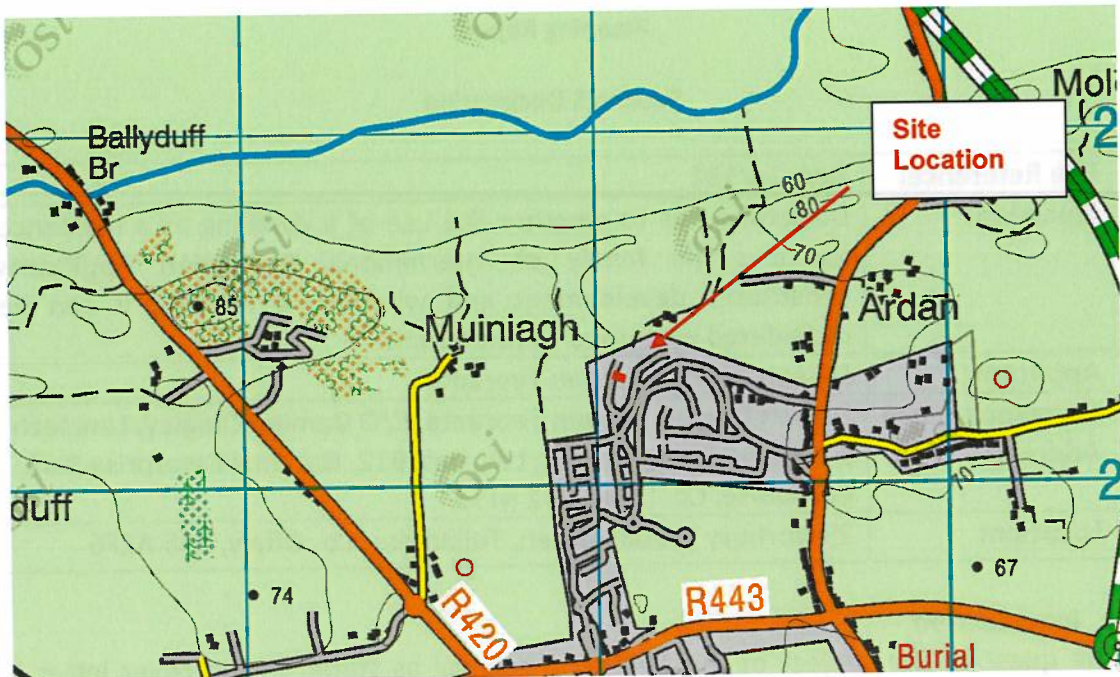
Figs 1: Site Location (Discovery Series)