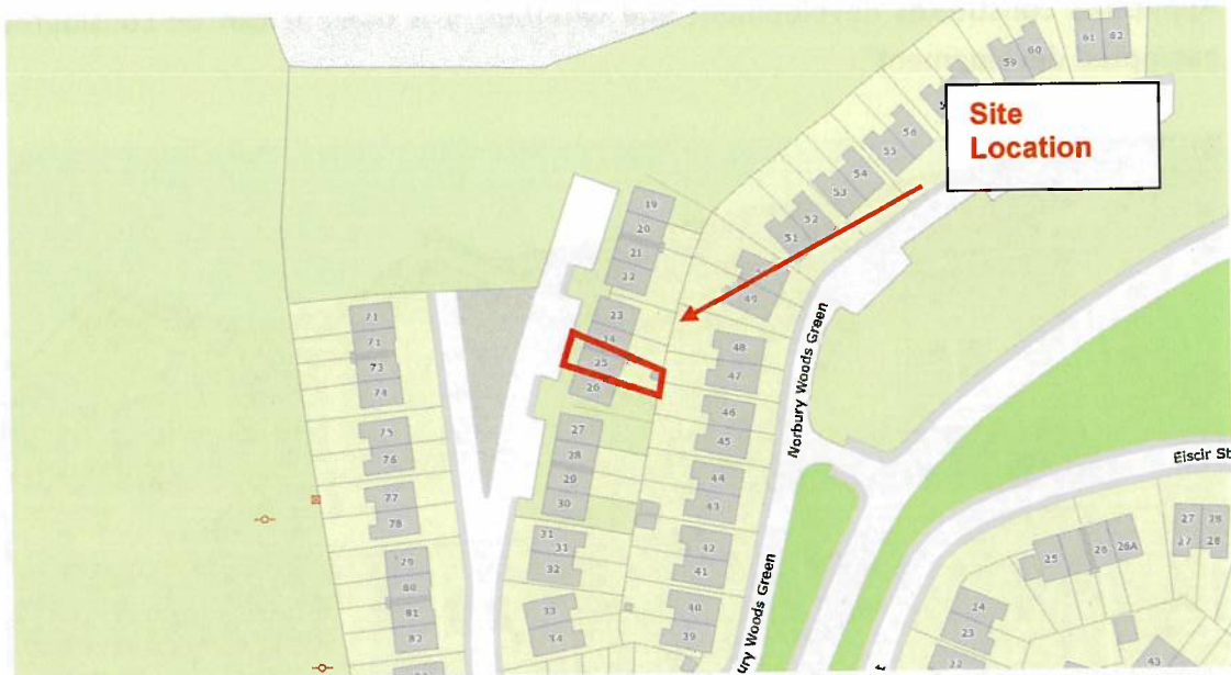
Figs 2: Site Location