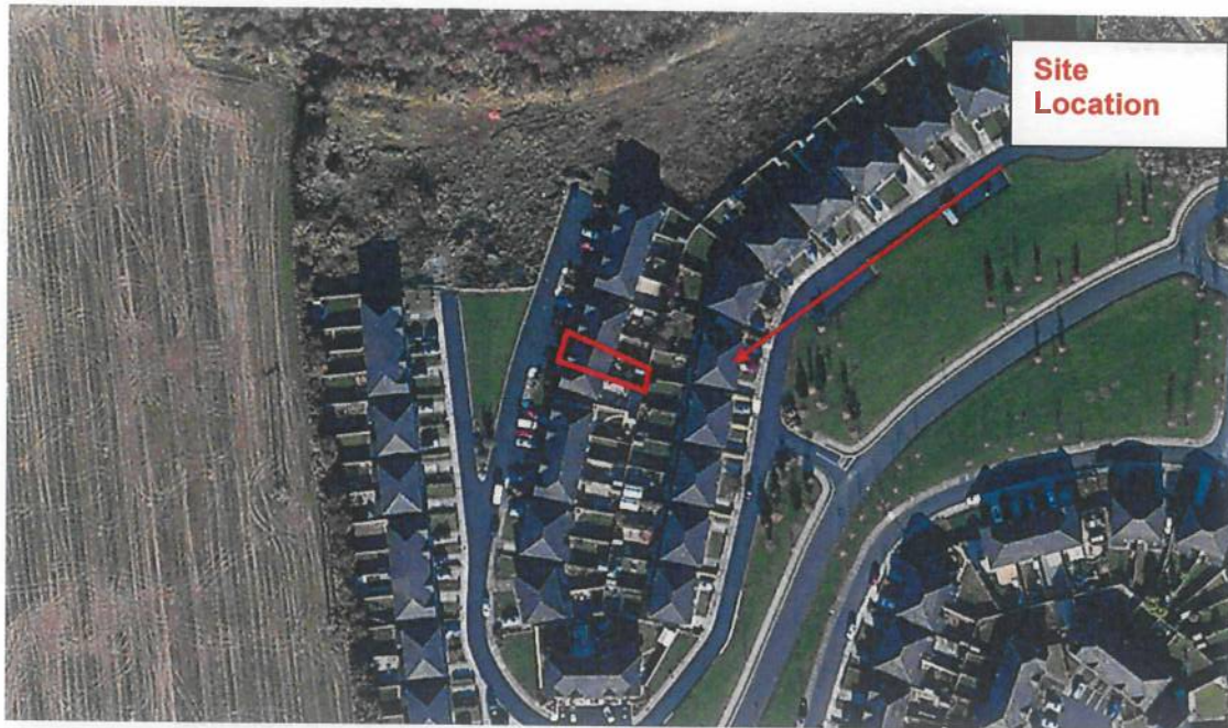
Figs 3: Aerial image of location of site