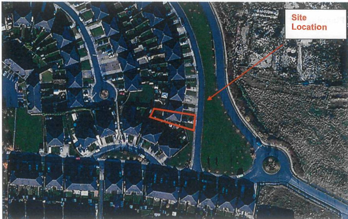
Figs 3: Aerial image of location of site