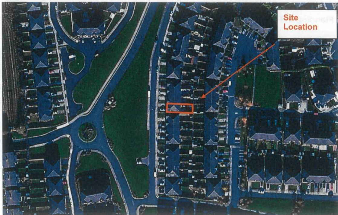
Figs 3: Aerial image of location of site