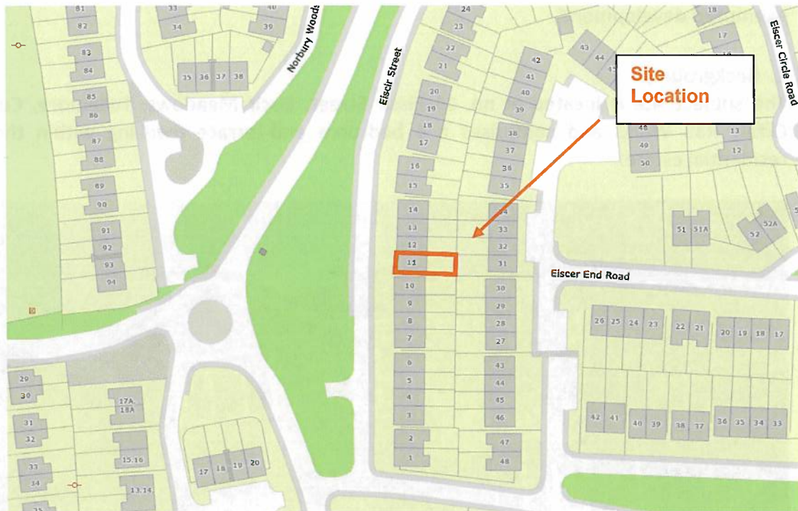
Figs 2: Site Location