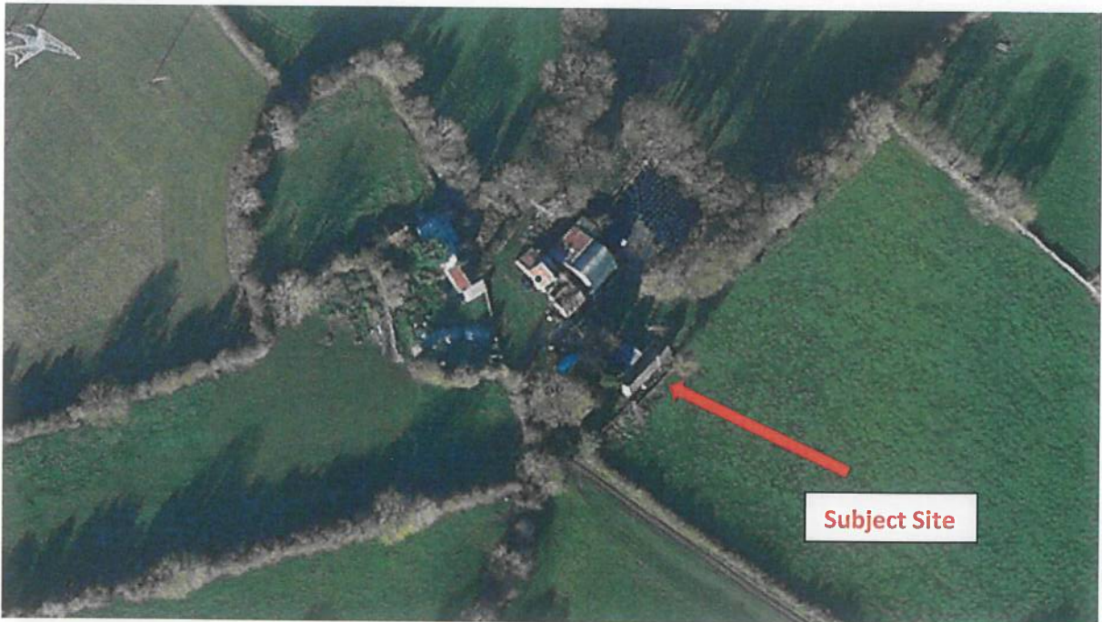
1. Subject Site Location

The existing dwelling is located in the countryside adjacent to multiple farm buildings and surrounded by mature vegetation. The dwelling house is approximately 2km from Ferbane Town Centre.