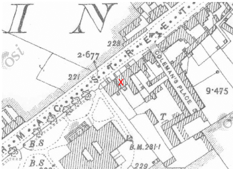
Historical OS 25" Map Site marked Red X