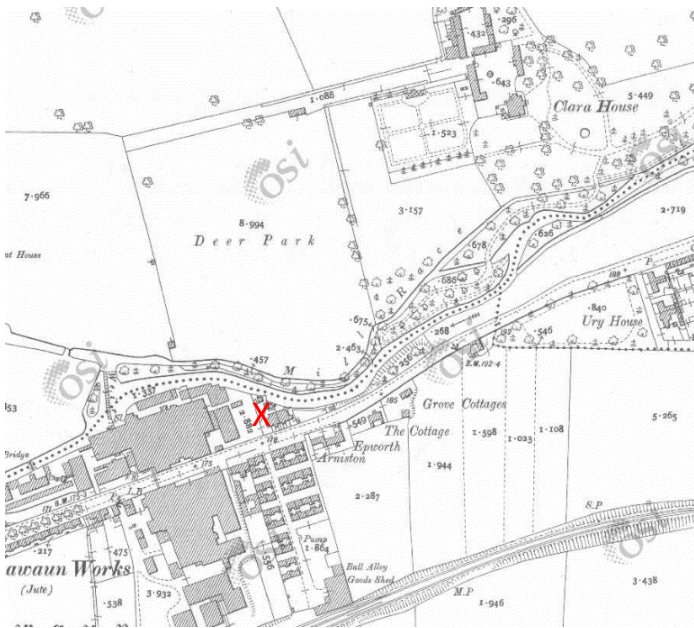
Historical OS 25" Map Site marked Red X