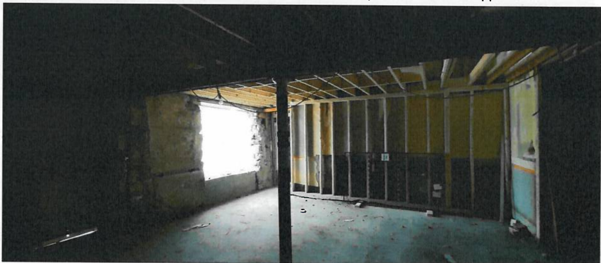
New stud wall to front staircase and adjoining room