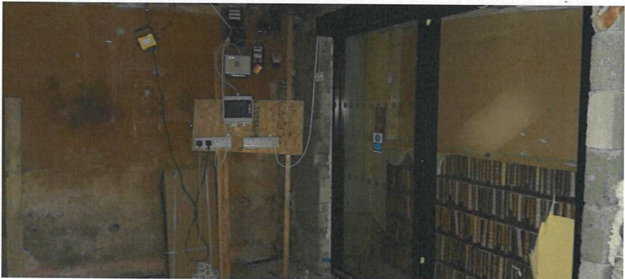
Former large window extended to floor as new glazed door – part of Retention Application PL22305