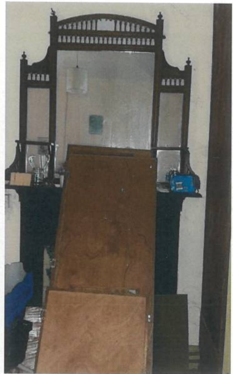
Some decorative features remaining including chimneypieces to former bedrooms and upper living room with overmantle and moulded cornice. Excellent upper windows with architraves, shutters and timber paneling.