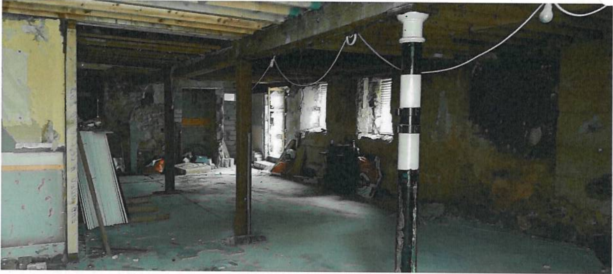
Former pub, walls, floors, ceilings stripped out