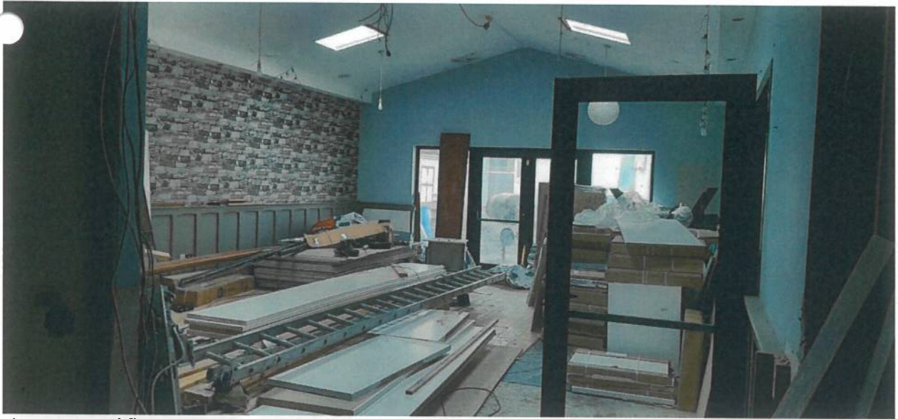
Large ground floor structure to the rear between two returns, does not appear to be on drawings