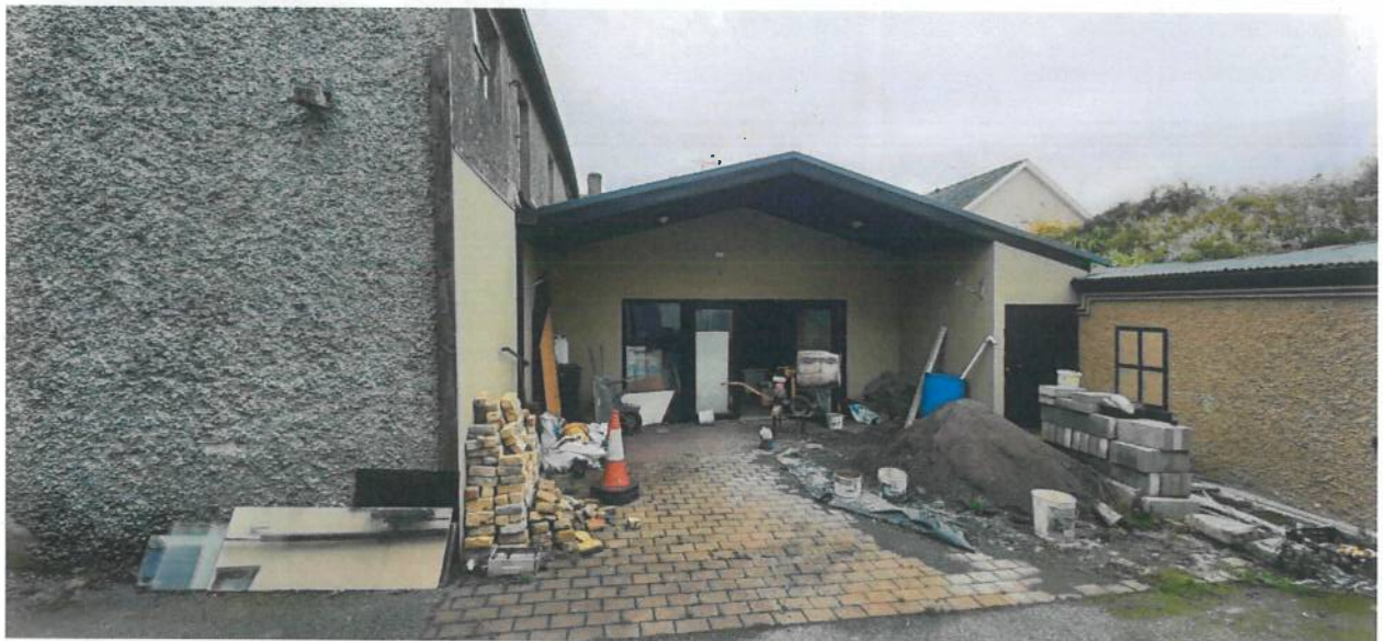
External view of same central room to the rear