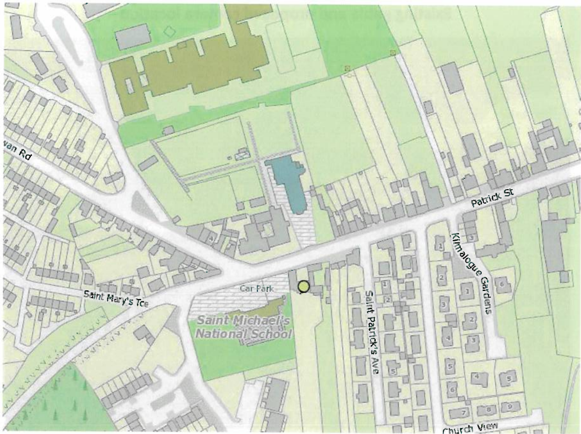
OSI MAP – existing layout