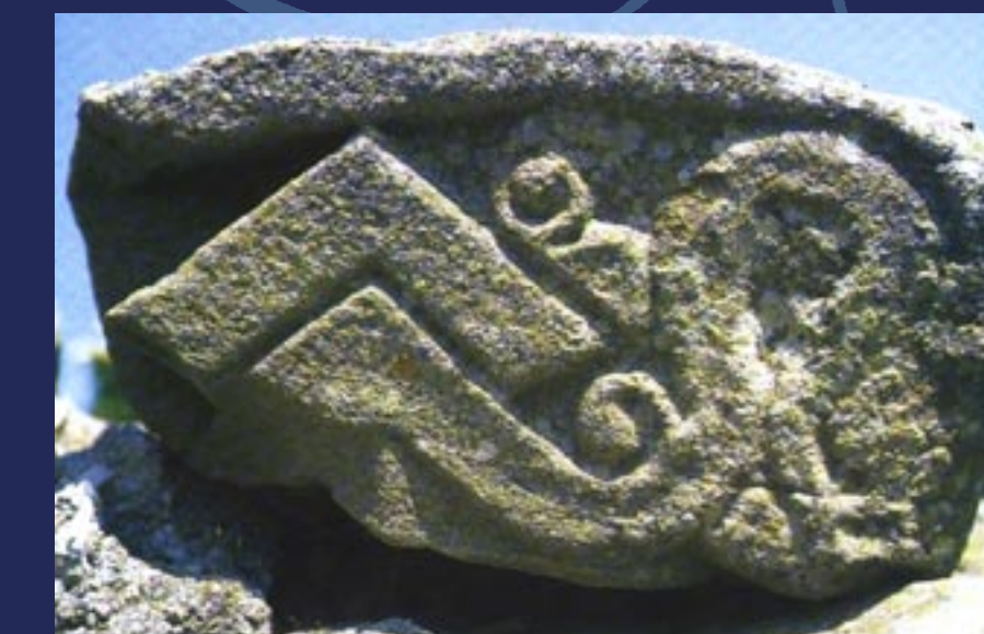
Fragment of carved stone at Drumcullen