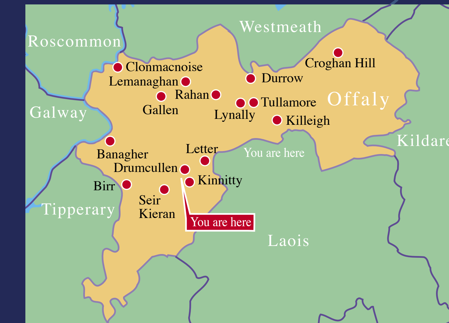
Map showing the position of Drumcullen in the ancient provinces of Ireland

Ó thuaidh, ar an talamh ard os cionn na reilige, feictear an "motte" nó tulach ar ar tógadh caisleán adhmaid de chuid na Normannaigh ag deireadh an dara haois déag. Is cosúil gur thóg Hugh de Lacey, Tiarna na Mí an caisleán seo, fear a thóg caisleán ar fud Cúige na Mí. Tá tuairim ann gur tháinig an Ard-Chrois ag Caisleán Chionn Éitigh ón suíomh manachúil seo, de bharr an bhaint atá ann le Rí na Mí.