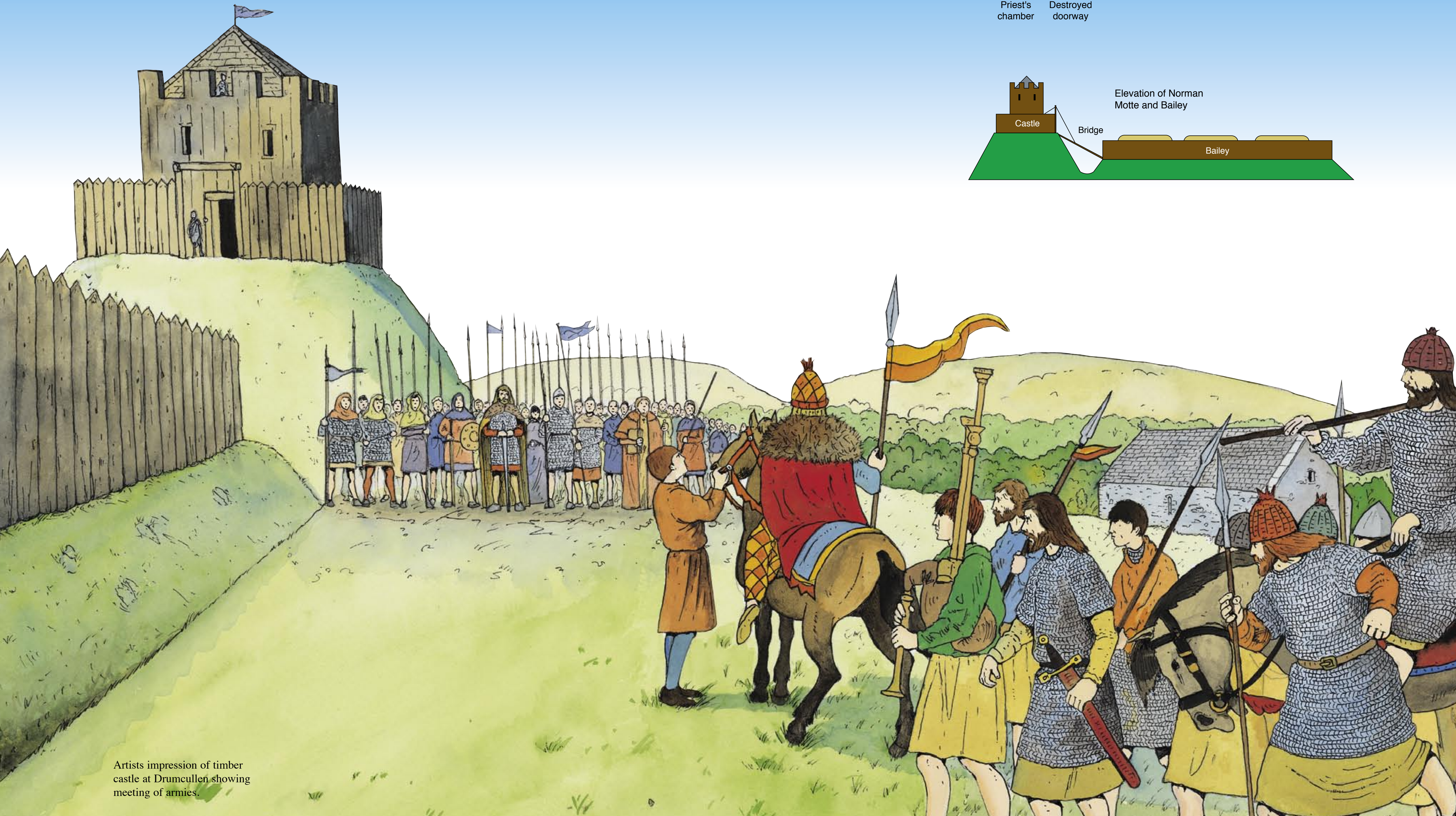
Artists impression of timber castle at Drumcullen showing meeting of armies.