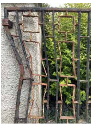
Poetry by Eileen Casey | Photography by Jackie Lynch

Weathered wrought iron Portal to pattern and shape Melding together