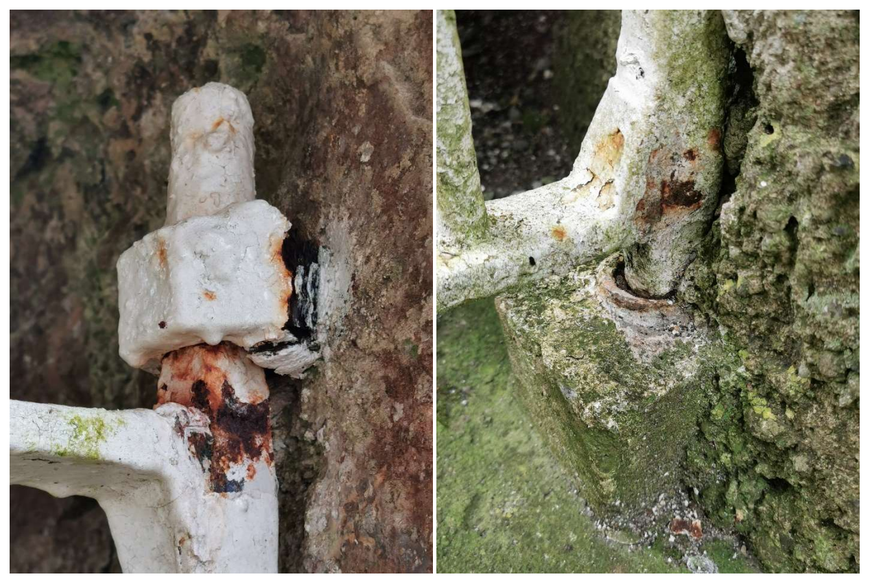
Wall fixing top and bottom. Loose bars (below)