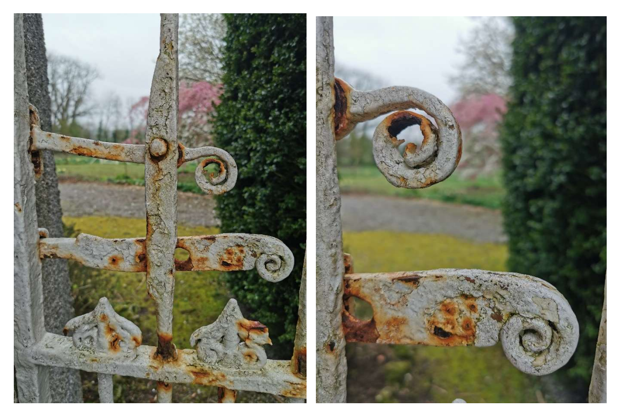
Scroll handle details, front and rear