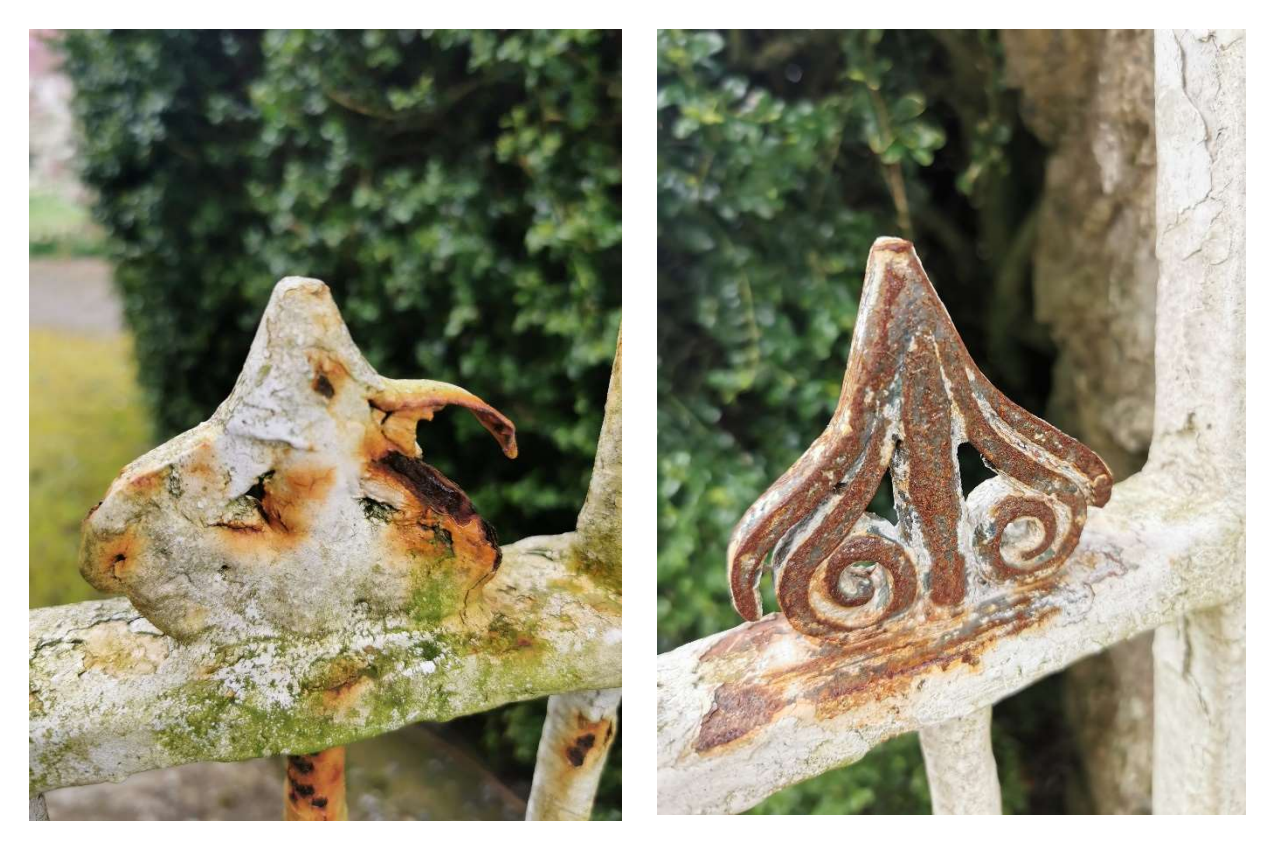
Overpainted and damaged elements