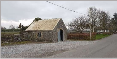
Figure 1 Prior to works