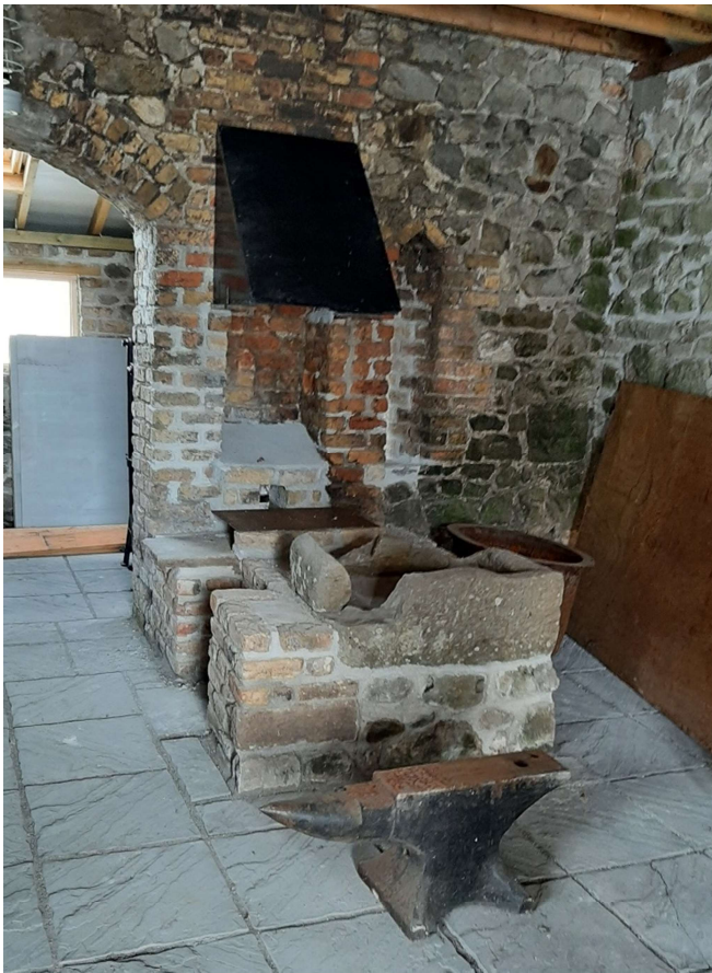
Internal fittings in place