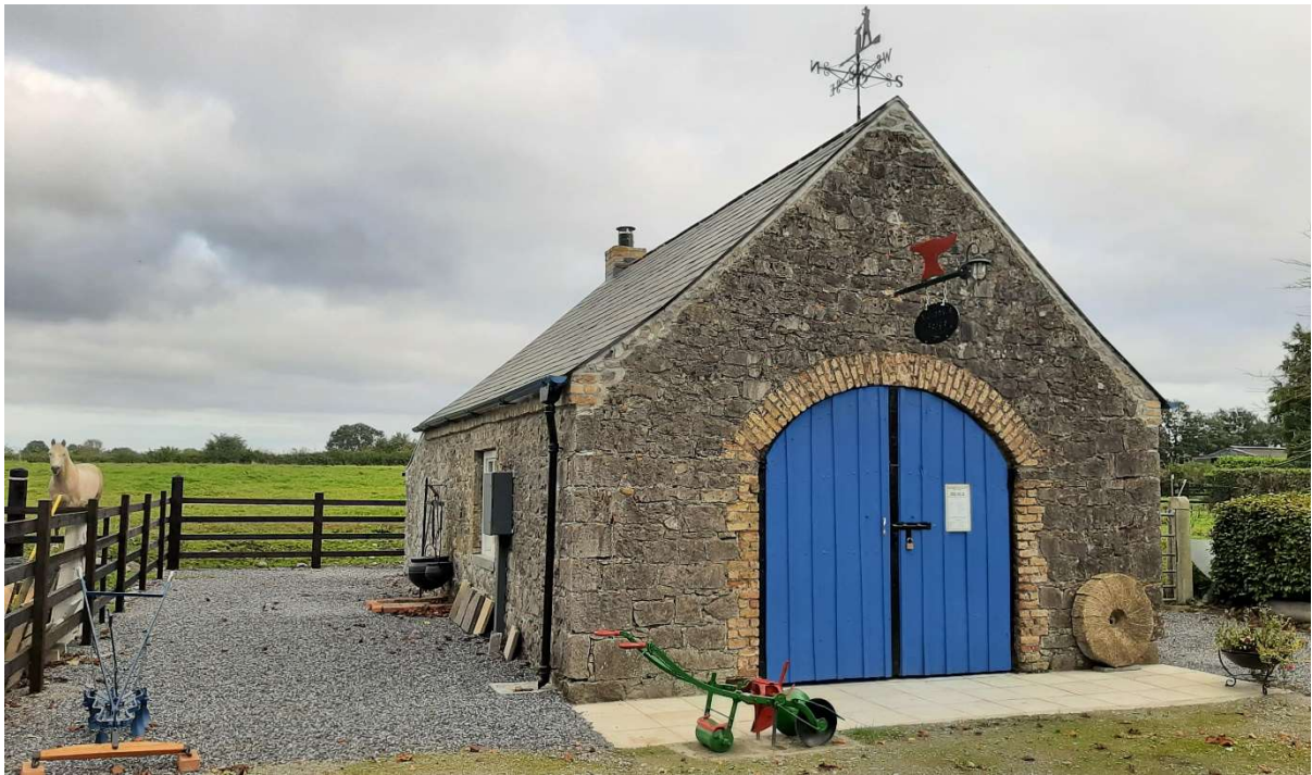
Vernacular fittings added to the site