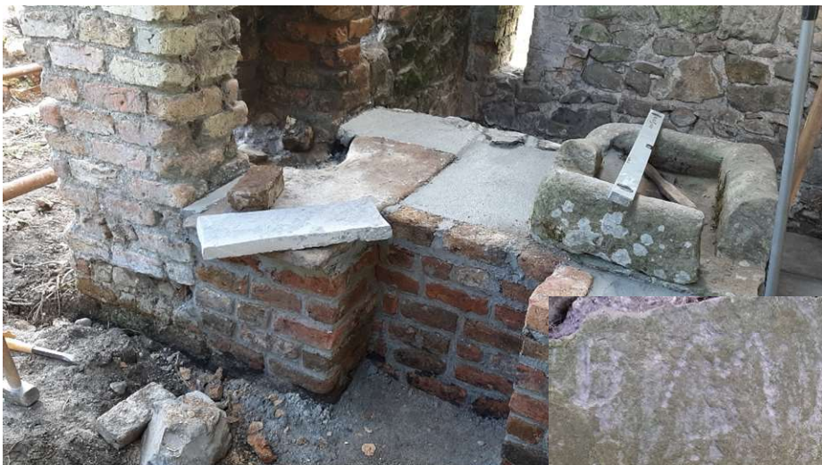
Furnace reinstatement with sink stone