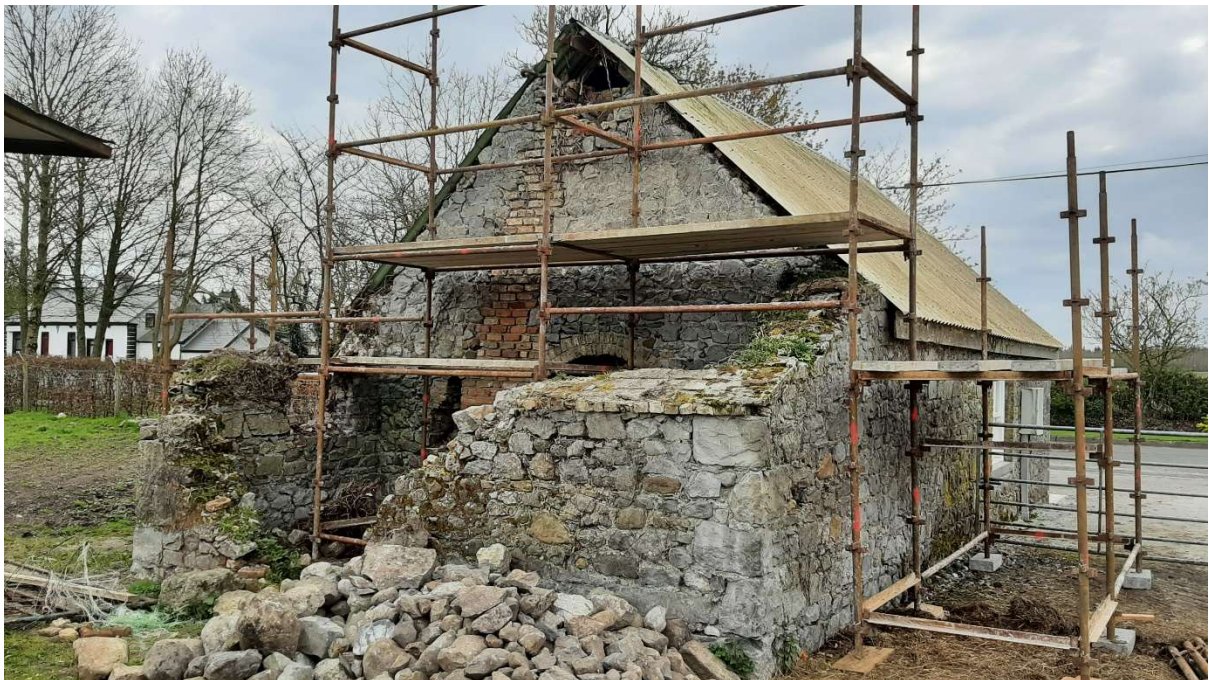
Rear elevation with ivy removed. Lean-to and surrounding loose stone collected for repairs