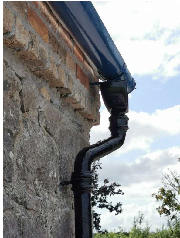
Gutters, downpipe and brick corbel detail