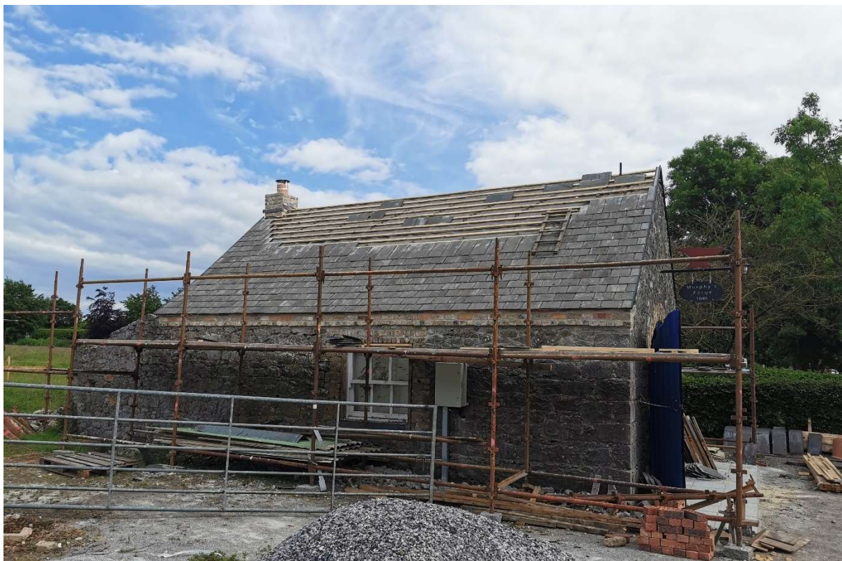
2021_0618 – Slating roof, repairs to chimney and brick corbel to eaves