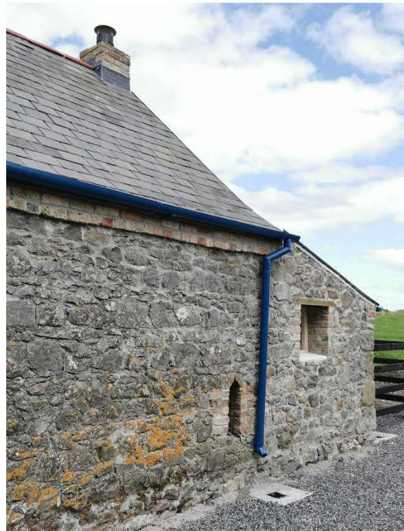
Rear lean-to also completed with slate roof