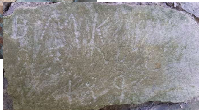
Internal wall stone with carving; 'BMK 1890'