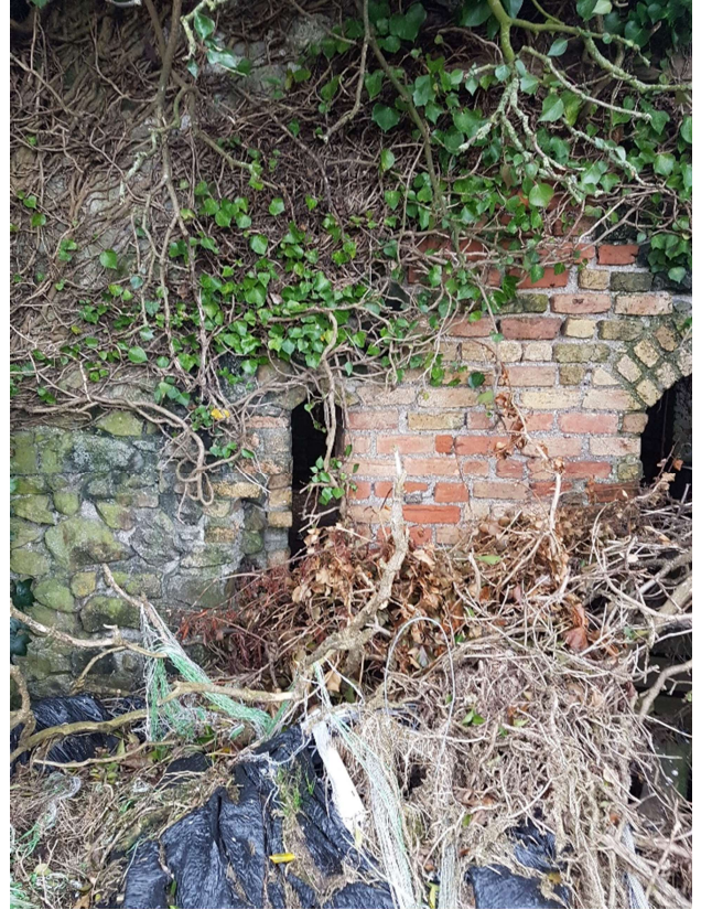
Rear door and brick arched opening, internal showing furnace location and external view