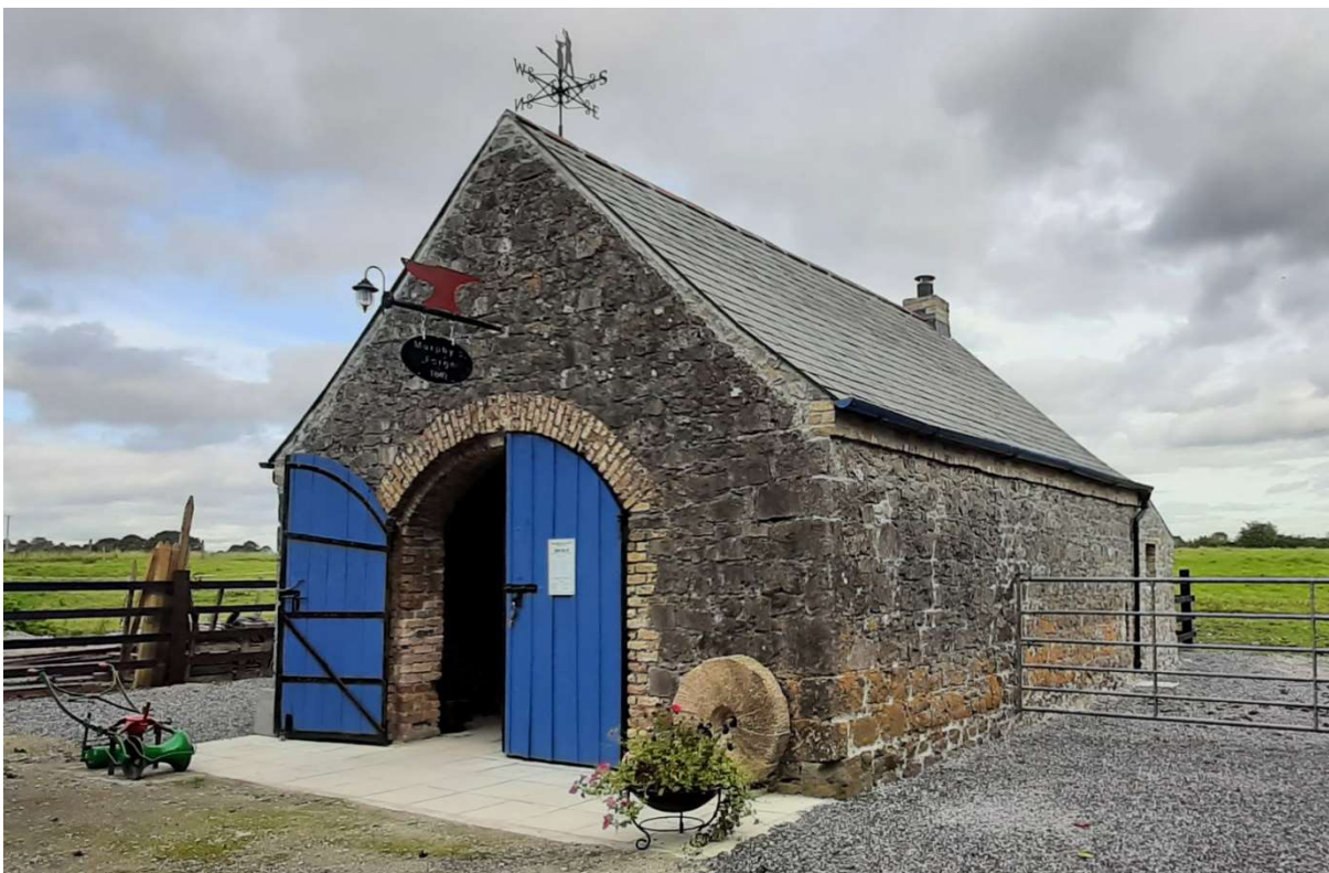
Completed exterior with notice in place