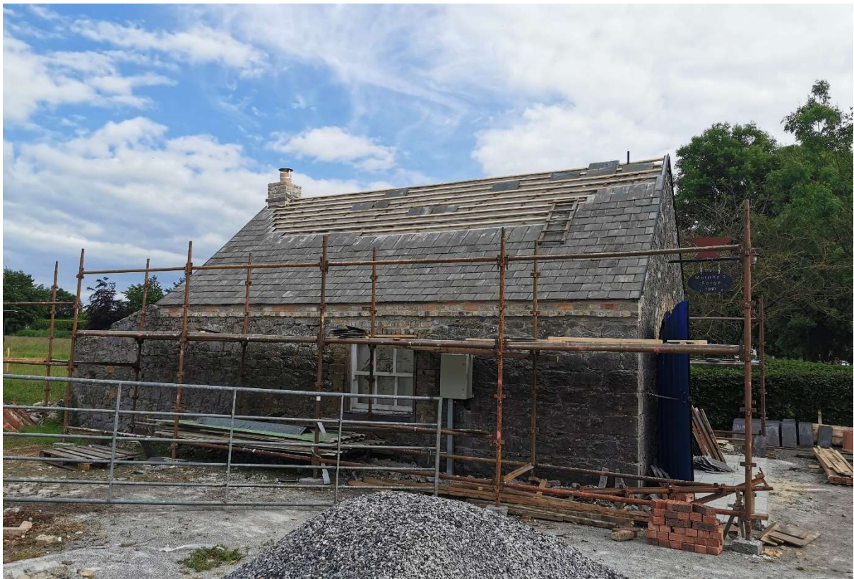
Slating underway, brick chimney repaired