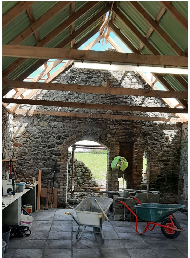
Gable repairs, brick and stone underway, retaining all openings and brick or pointed arched detailing, corrugated metal roof removed