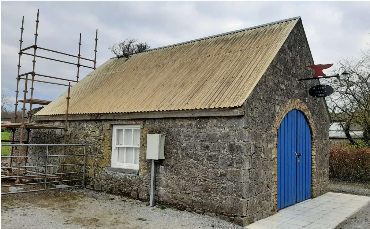
New doors and window in place (2021_0420) scaffolding in place for gable repairs