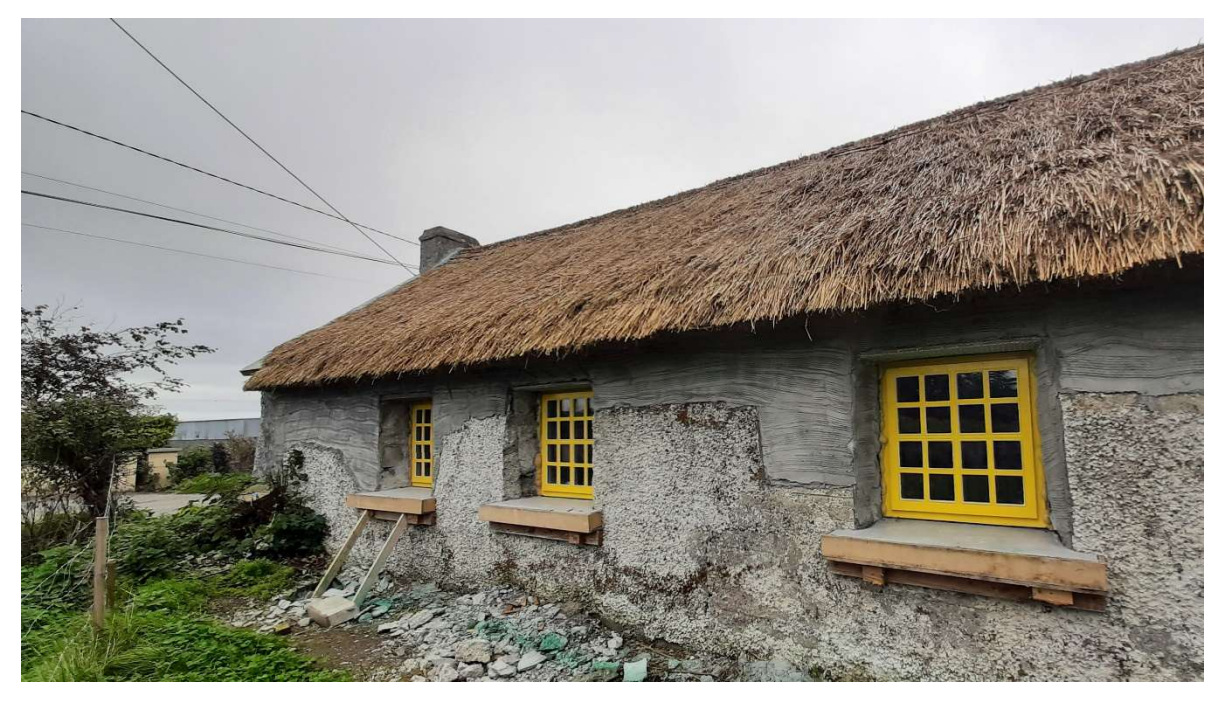
Three new timber windows in rear elevation