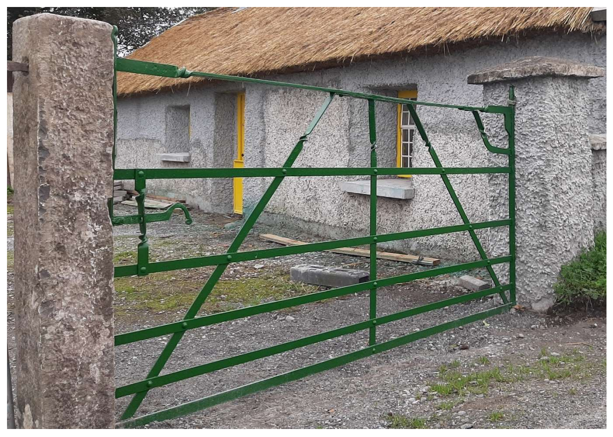
Gate repaired and installed with cut stone pillar found on site