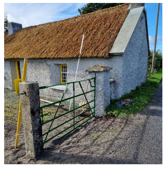
<u>CI Vernacular 21/03 Thatched House, Derrybeg, Co. Offaly</u> Repairs/reinstatement of windows (note mix of existing steel windows and timber sash) and repair to existing wrought iron entrance gate.

Note when this property was purchased by the current owner it was in a derelict state with the roof and much of the walls collapsed (see 2018 photo). He has rebuilt the walls and roof, rethatched the roof and repaired front steel pivot windows.