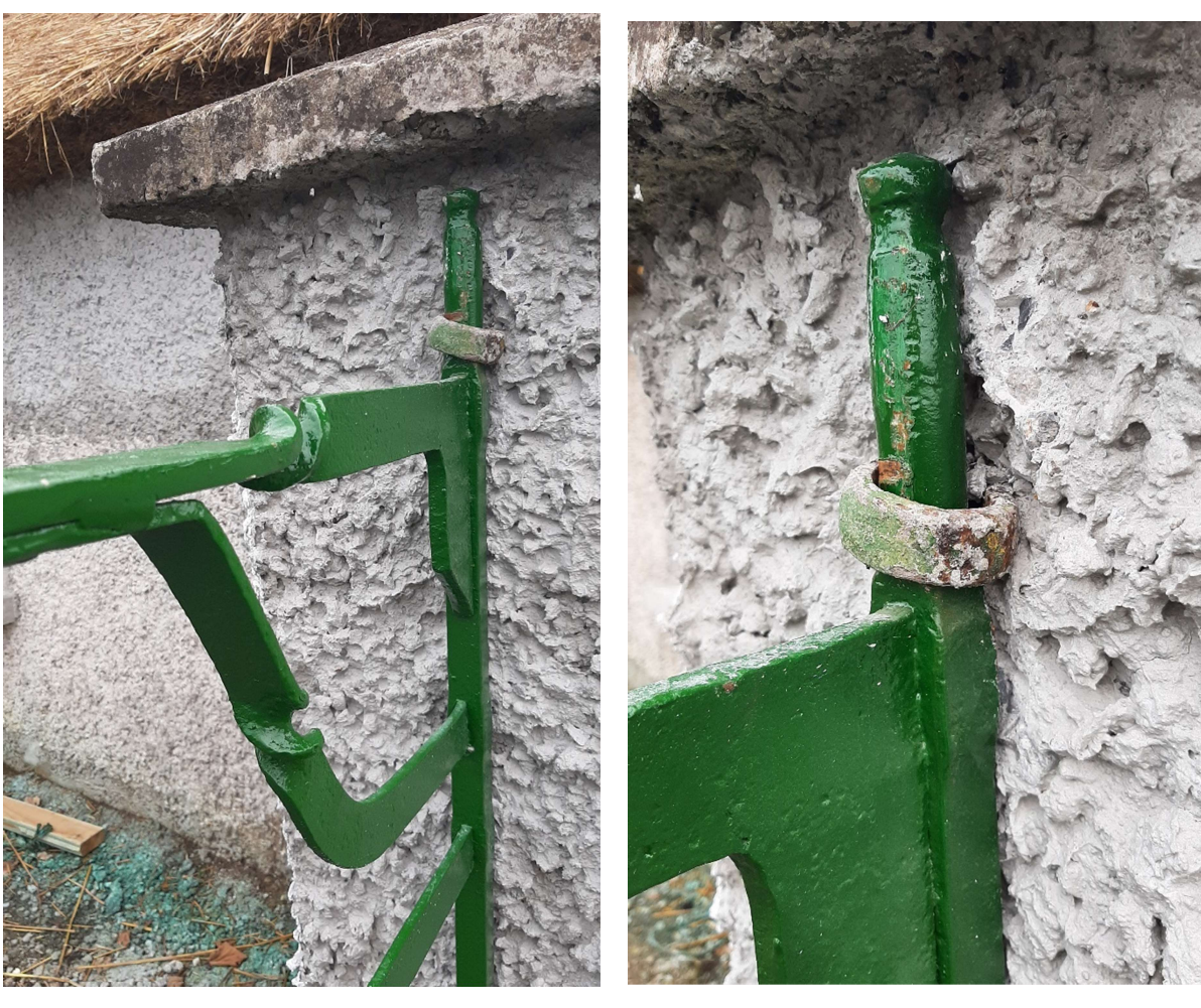
Original pier re-dashed to match house, bracket detail + Fixing detail