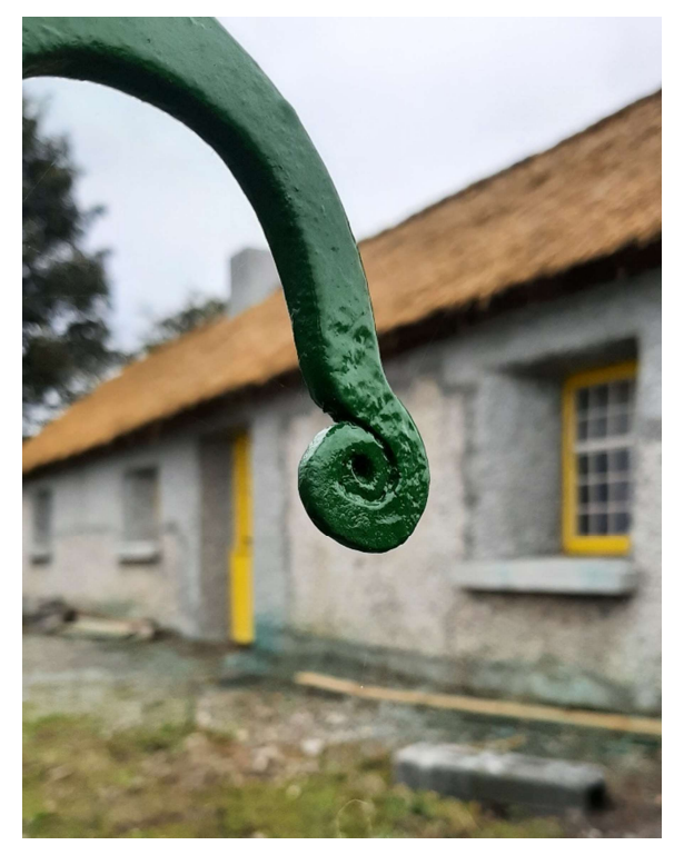
Scroll end to handle