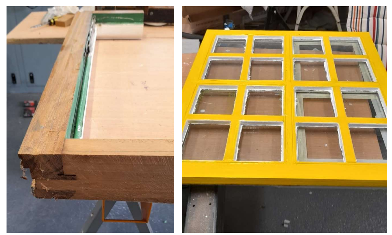
Special windows under construction