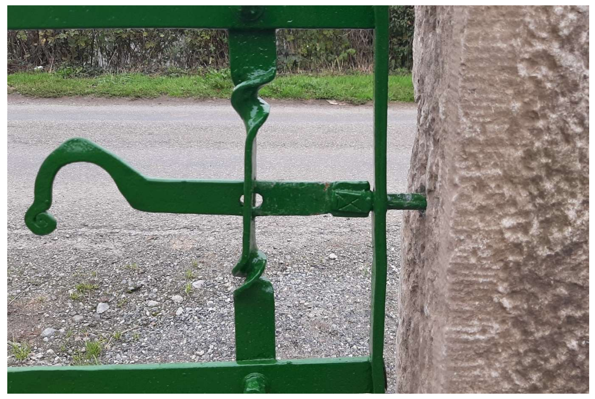
Latch detail with curved handle and scroll finial. Note blacksmith mark (X) at latch bar.