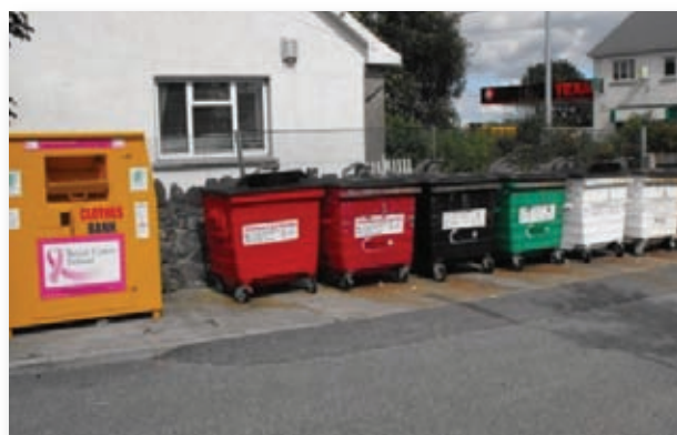
Figure 8.2 Bring Bank System - Wheeled