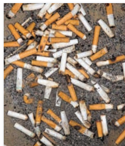
Figure 9.3 Cigarette Litter