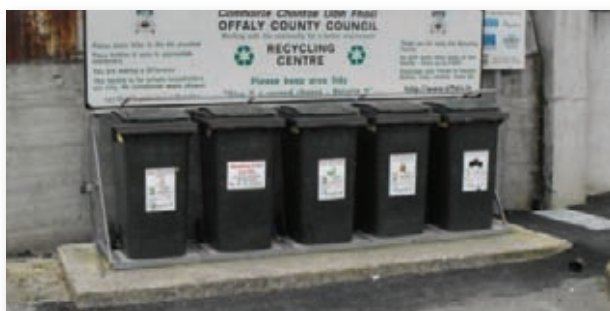
Figure 8.2 Bring Bank System - Wheeled

Litter, as well as being unsightly, has many detrimental aspects which affect the ability of the County to develop to its full potential. Passing pedestrians and motorists constitute the largest causative factor in litter pollution in Offaly according to the National Litter Monitoring Body. Passing pedestrians account for 42% and motorists account for 25%. This shows a correlation to the composition of litter found during the surveys, i.e. people smoking, eating and drinking on the street or dropped from passing vehicles.