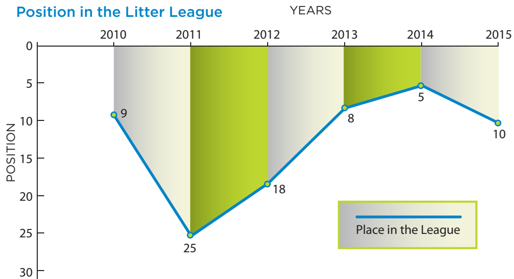
Figure 4.0 IBAL Anti Litter League results