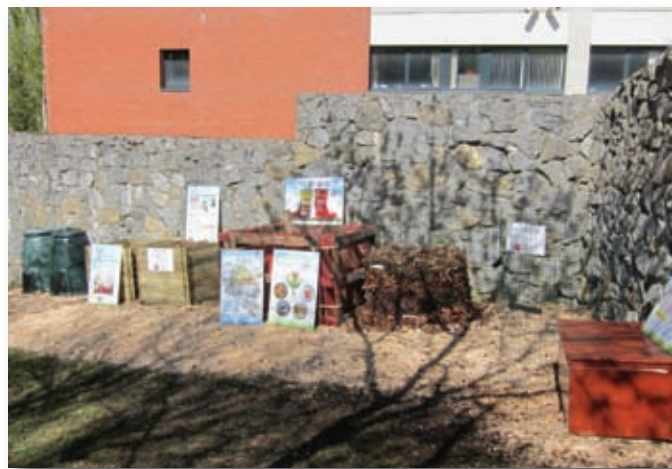
Figure 2.0 Community Composting at Lloyd Town Park, Tullamore

The Council has run Tidy Towns seminars for groups over the last number of years. This is run in conjunction with the Local Community Development Committee and is tailored towards the needs of the groups. They are invited to attend a seminar on topics which they find most difficult in the National Tidy Towns Competition, such as Litter, Waste Minimization and Biodiversity. The Council also piloted a “walk and talk” audit of the local towns/villages by Tidy Towns experts over two days and an evening seminar to discuss issues of common interest and concern. The Council continues to build on this relationship with groups and is always keen to introduce new initiatives. One such initiative was the Stop Food Waste/ Master Composting Course in 2013. The Council facilitated a course for all Tidy Towns Groups which was held over a seven week period with the end result being that each group set up a community composting system suitable to the needs of their local community. Below is a picture of the Tullamore composting site set up by the group in Lloyd Town Park. This was then transported to the Tullamore Show for demonstration purposes.