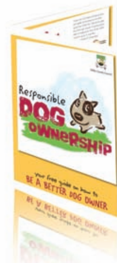
Figure 9.2 Leaflet on dog owner responsibility