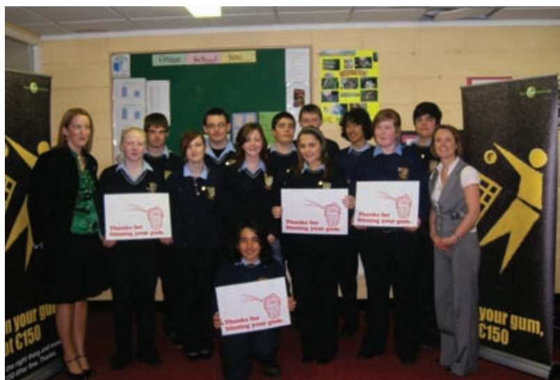
Figure 5.0 Students and Green Schools CoOrdinator from Oaklands Community School and Environmental Awareness Officer from Offaly County Council