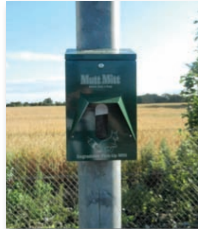
Figure 9.1 Doggy Bag/Mutt Mitt dispenser

As has been demonstrated in Section 4, cigarette related litter continues to be the largest composition of litter in Offaly. Under the Litter Pollution Act, occupiers are obliged to keep their place free from litter and this would include, shop owners, publicans and businesses. The Council ran an awareness campaign a number of years ago on cigarette litter and although many premises have specific bins for used cigarette outside their premises, there is still work to do in this regard.