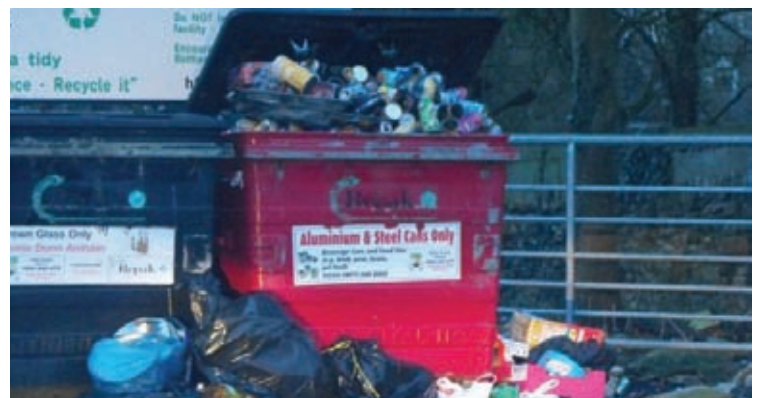
Figure 9 Illegal dumping in remote areas of the county