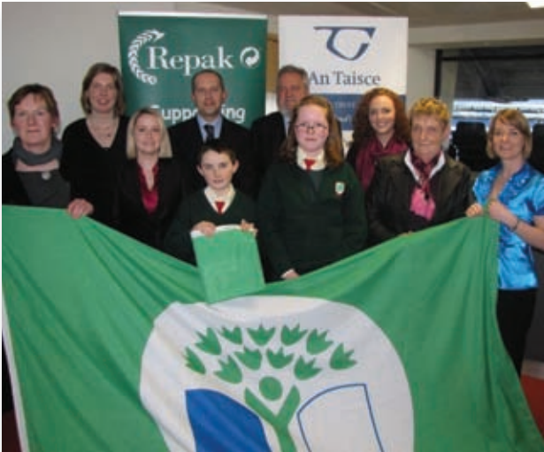
Figure 1.0 Coolderry National School being presented with their Litter & Waste Green Flag

The Green Schools Programme is greatly supported within the Council with visits made to the schools by the Environmental Awareness Officer to give talks on litter and waste as well as facilitating and financing environmental workshops. An annual teacher training seminar is held to inform and advise schools on the programme and its different themes. The Council also offers resources such as free compost bins, litter pickers, clean up kits and sometimes offers financial assistance for green initiatives where possible.