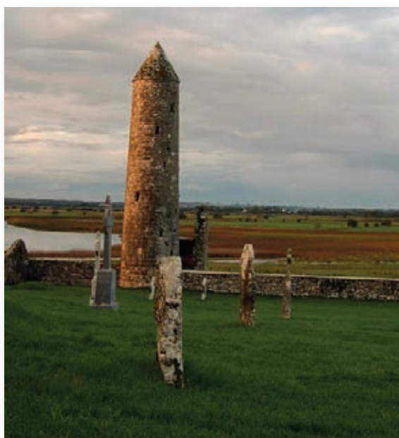
Round Tower at Clonmacnoise

The County of Offaly is situated in the middle of Ireland, bordered by 7 counties and covers approximately 493,985 acres, one fifth of which is peatland and the majority of the remainder being in agricultural or forestry use. Its current population is 76,687 (census 2011) with the majority of the population residing in rural areas and the largest towns being Tullamore, Birr and Edenderry. There are many places of interest in Offaly which are tourist attractions, such as Birr Castle, Clonmacnoise, Croghan Hill and Tullamore Town Park.