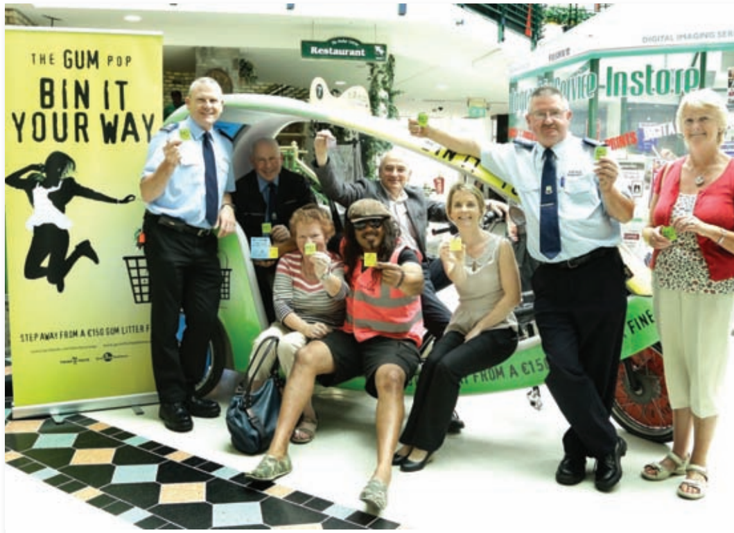
Figure 3.0 Staff from Offaly County Council, representatives from Tidy Towns and the Gum Litter Taskforce in the Bridge Centre, Tullamore in 2014

authority representatives. It is primarily an educational campaign with national media advertising about the chewing gum issue in which the Councils apply and are selected to participate in. Offaly County Council participated in this campaign in 2009, the former Tullamore Town Council participated in 2013 and the County participated again in 2014. Schools were also involved, with a mid season launch in Oaklands Community School, Edenderry.